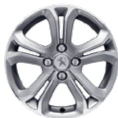
16" ALLOY wheel rim - ALLURE Helium