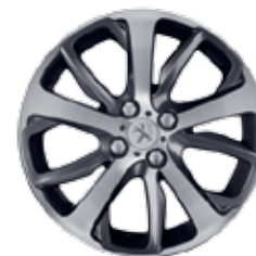
17" ALLOY wheel rim - ALLURE PREMIUM & ALLURE SPORT Oxygen