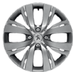
15" wheel trim - ACTIVE