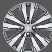
17" AREGIA diamond-cut alloy wheels