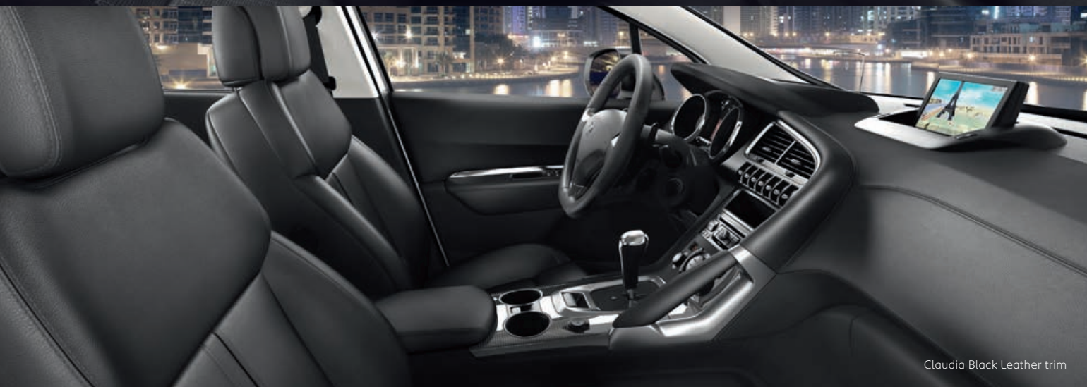
Claudia Black Leather trim