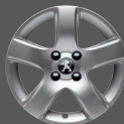
16" ISARA alloy wheels only available with Grip Control®* option