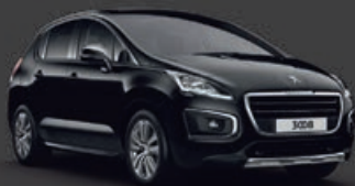
Perla Nera Black