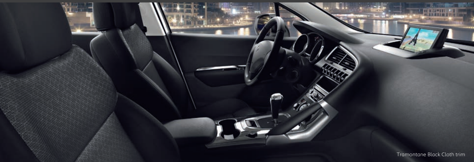
Tramontane Black Cloth trim

* Premium pack available at additional cost