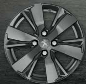
HYDRE 16" alloy wheel – Glossy Dillium Grey*