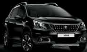
Perla Nera Black