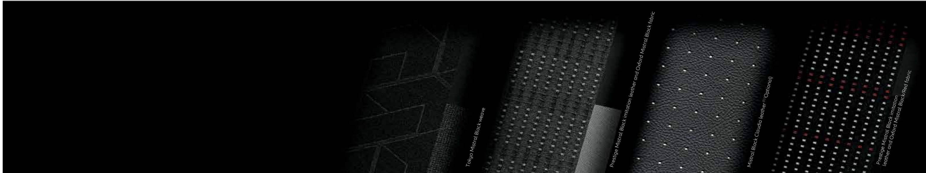
Tokyo Mistral Black weave

*Trims available depending on version. (1) Leather and other materials .