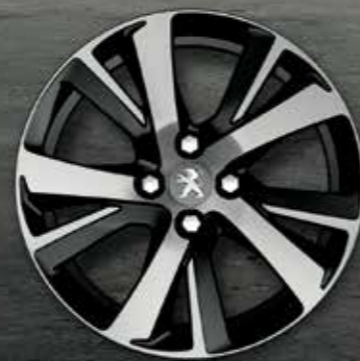
ERIDAN 17" alloy wheel – Glossy Black, diamond-cut***