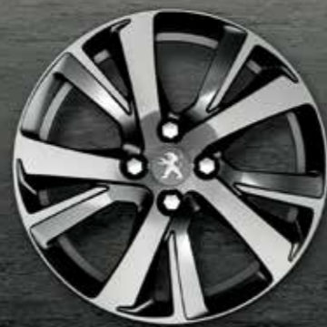
ERIDAN 17" alloy wheel – Glossy Anthra Grey, diamond-cut**