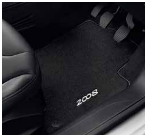
✂ Velour carpet mat set