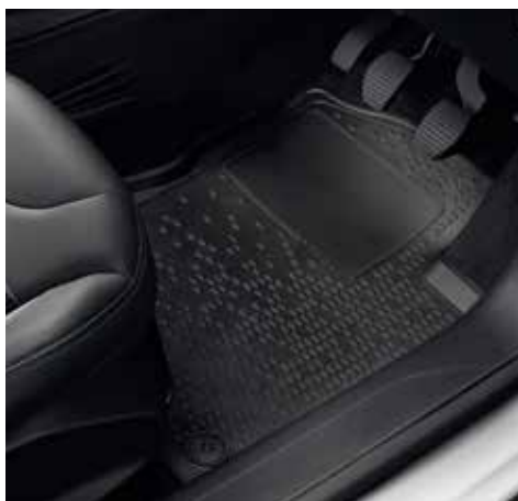
✂ Rubber carpet mat set