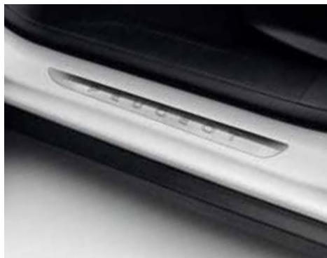
Stainless door sill protectors