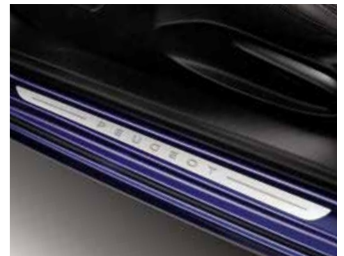
Aluminium effect door sill protectors