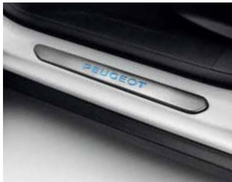
Backlit door sill protectors