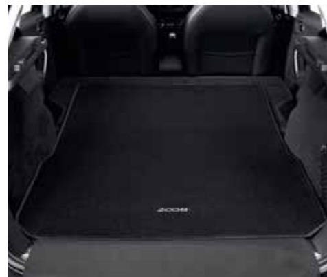
✂ Extended Boot Mat