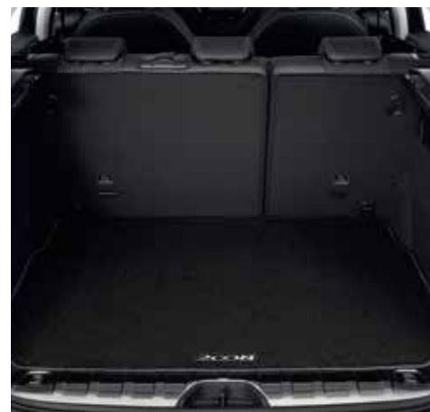
✂ Boot mat