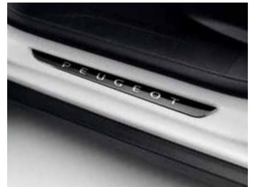
Dark chrome door sill protectors