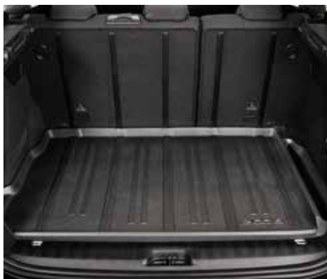
✂ Flexible boot tray