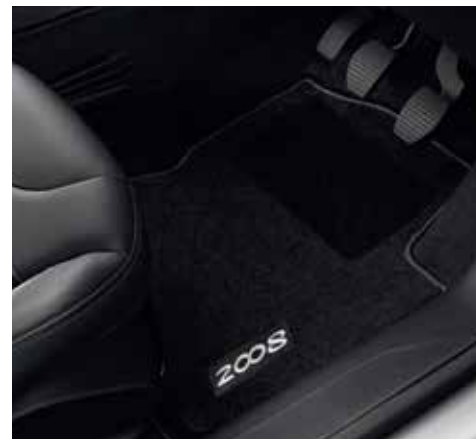
✂ Standard carpet mat set