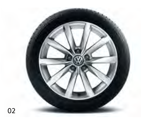
01 Toronto 16x6.5" alloy wheels 02 Dijon 17x7" alloy wheels 03 Sporty wagon silhouette