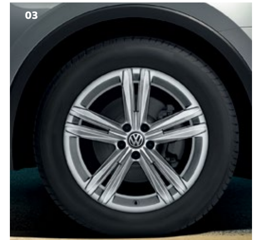
03 Sebring, alloy wheel 18inch, sterling silver Part. no. 5NA07149888Z