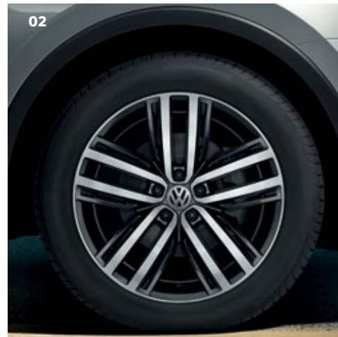
02 Auckland, alloy wheel 19 inch, gloss machined Part. no. 5NA071499NQ9