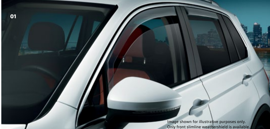
Image shown for illustrative purposes only. Only front slimline weathershield is available.