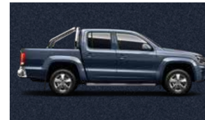
Starlight Blue | Metallic paint finish | 3S3S