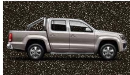
Mojave Beige | Metallic paint finish | 1B1B