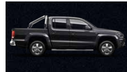
Deep Black | Pearl paint finish | 2T2T