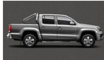
Indium Grey | Metallic paint finish | X3X3