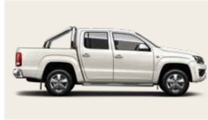
Candy White | Solid paint finish | B4B4