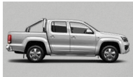
Reflex Silver | Metallic paint finish | 8E8E