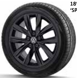
18" black alloy wheel 'SPRINGFIELD'