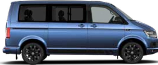
Acapulco Blue Metallic