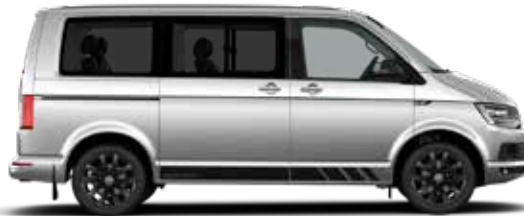
Relex Silver Metallic