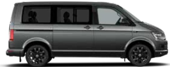
Indium Grey Metallic