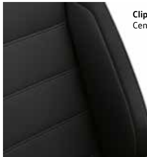
Clip Uni cloth upholstery in Titanium Black with white coloured stitching. Centre seatpanel and inner seat bolsters in cloth, side seat bolsters in "Carbon A" leatherette.^