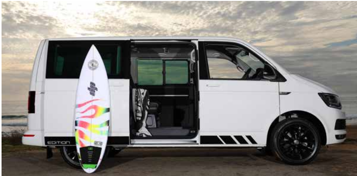
01 Dynamic suspension. Lowered running gear (approx. 20mm) with reinforced anti-roll bar and specific tuning for the suspension and shock absorbers mean a smooth and comfortable drive.