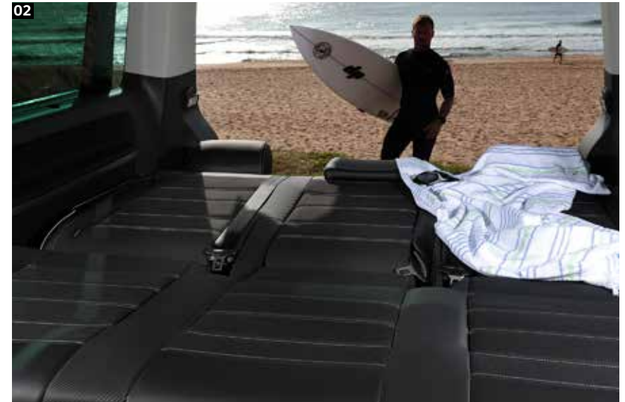
02 Adjustable seat configuration. With up to seven comfortable seats, you and your passengers can enjoy the ample head and leg room, even in the second and third rows. Depending on your requirements, you can rearrange the passenger and luggage space with the aid of the ingenious rail system, which allows for simple and continuous sliding of the 3-person rear seat row, and individual seats. In addition the 3-seater bench seat can be folded forward and reclined into a flat bed position.