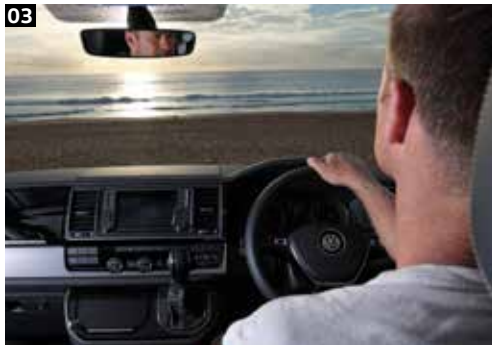
03 Servotronic steering wheel. The speed-sensitive power-assisted steering system senses what's needed automatically and adjusts the steering accordingly providing increased manoeuvrability while driving and parking.