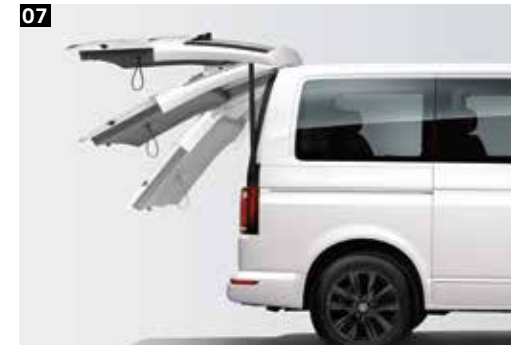
07 Electric tailgate. The electric tailgate features a variety of control options that make it even more convenient to use: via the button on the driver's door cladding (opening), via the tailgate handle (opening), Opening height can be set and stored via the button on the tailgate cladding (closing and stopping). The parking sensors will also check whether there is enough space to open the tailgate.