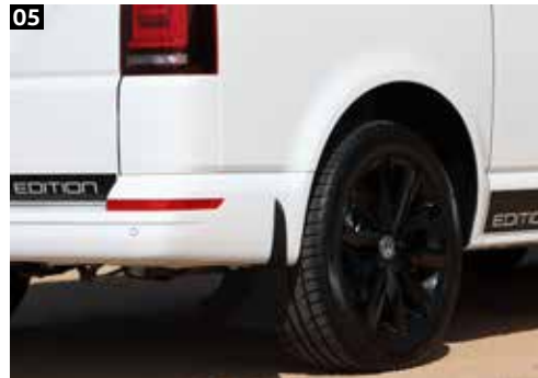
05 Design Elements. Combined with the gloss black roof, B-pillars and side mirrors, Multivan Black Edition is finished off with 'Edition' decals on the side sills and on the rear tailgate which will set you apart from the crowd.