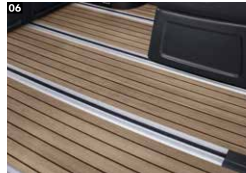
06 Wooden floor. The durable and washable 'Halifax Maple' wood look floor provides a cosy ambience in the passenger compartment.