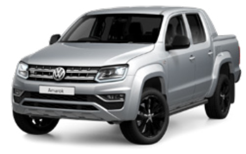
*Reflex Silver | Metallic | 8E8E