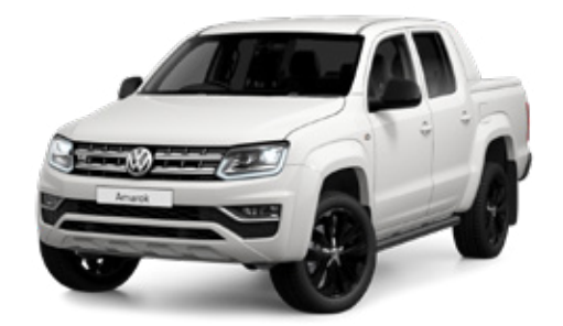
Candy White | Solid | B4B4

Art Velour | Cloth seat upholstery | Titanium black