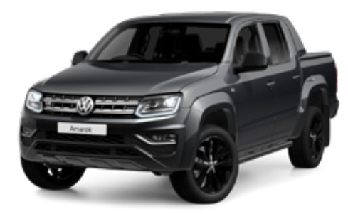
*Indium Grey | Metallic | X3X3

*Please note that Metallic and Pearl affect paint are optional at additional cost.