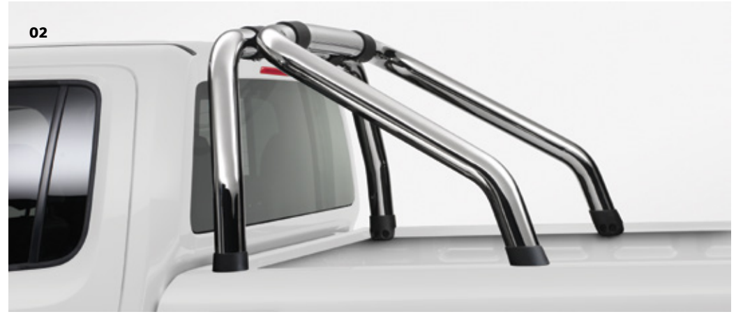
02 Silver Styling Bar Made from high quality stainless steel, the Amarok genuine styling bar with its twin pipe design lends the Amarok as a powerful ute.