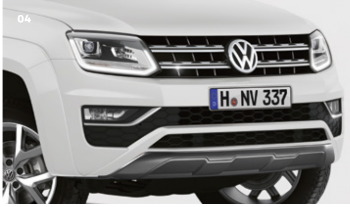
04 Front bumper design element - Silver Dynamic off-road look: the striking Volkswagen genuine design trim for the front skirt gives your Amarok a particularly powerful and rugged character.

Part. no. 2H0071691L041 Matte black MRRP* $1,020.80 MRRP Fitted** $1,174.80