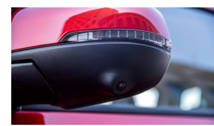
▲ Curbside camera

The GWM Ute was born to tackle the toughest jobs but it was also built smart with a full suite of comprehensive safety systems designed to protect occupants and other road users.