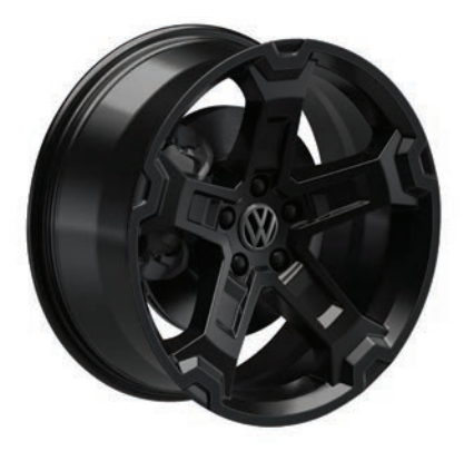
20" x 9" forged 'Clayton' Alloy Wheels With 275 / 50 R20 Pirelli Scorpion ATR Tyres

*Please note that Metallic and Pearl affect paint are optional at additional cost. # Leather appointed seats have a combination of genuine and artificial leather, but are not wholly leather.