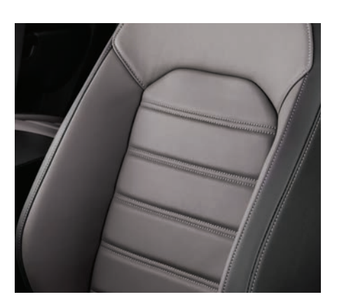
Vienna Leather<sup>#</sup> Trim Two-colour Vienna Leather<sup>#</sup> upholstery in Palladium Grey /Titanium Black