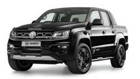
Deep Black (PE)