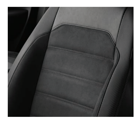
Art Velour Trim Two-colour microfleece seat upholstery in Palladium/Titanium Black