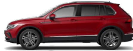
Kings Red M