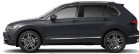
Dolphin Grey M