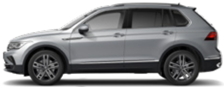
Reflex Silver M