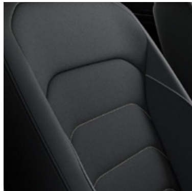
Tiguan Elegance models Black Vienna leather#