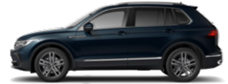
Night Shade Blue M