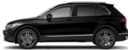
Deep Black PE