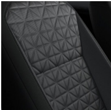
Tiguan Life models Black Comfort Cloth