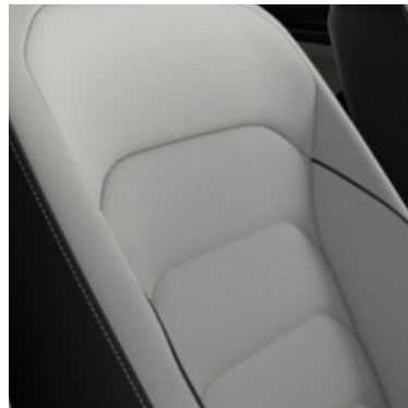
Tiguan Elegance models Optional Storm Grey leather#