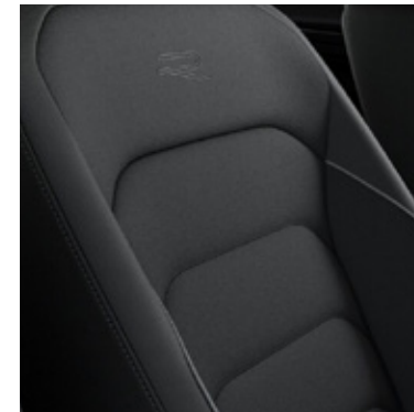
Tiguan R-Line models Black R-Line Vienna leather#

Please note that Metallic, Pearl Effect, Premium and Premium Metallic paint are optional at extra cost. The print process does not allow for exact reproduction of the exterior or the upholstery colours.