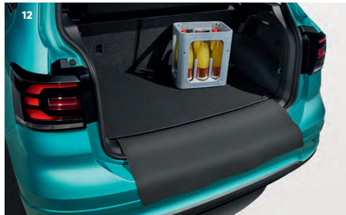
12 Reversible luggage compartment mat The perfectly fitting, reversible luggage compartment mat helps out when you have sensitive, dirty or damp goods to take. You can choose from soft and gentle velour on one side or sturdy, anti-slip plastic nubs on the other. To make things even easier, a built-in protective cloth can be folded out from the reversible mat to help avoid scratches to the loading sill when you're loading and unloading.