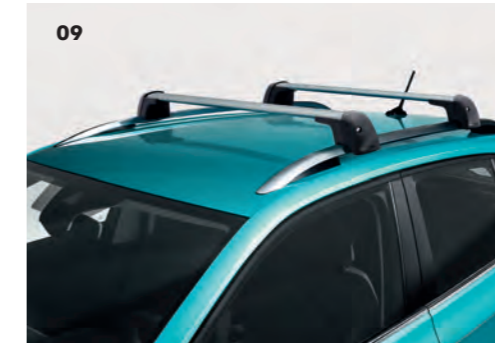
09 Roof Bars The genuine roof bars provide the base for all roof attachments and are aerodynamically designed to suit the T-CROSS. Load capacity: 70kg Part.no 2GA071151A