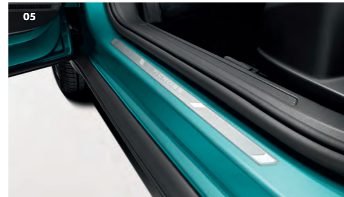
05 Door sill protection plate The high-quality aluminium door sill plates with T-Cross lettering not only protect the heavily used entrance area but adds a more premium look to your vehicle. For the front. Part.no 2GM071303