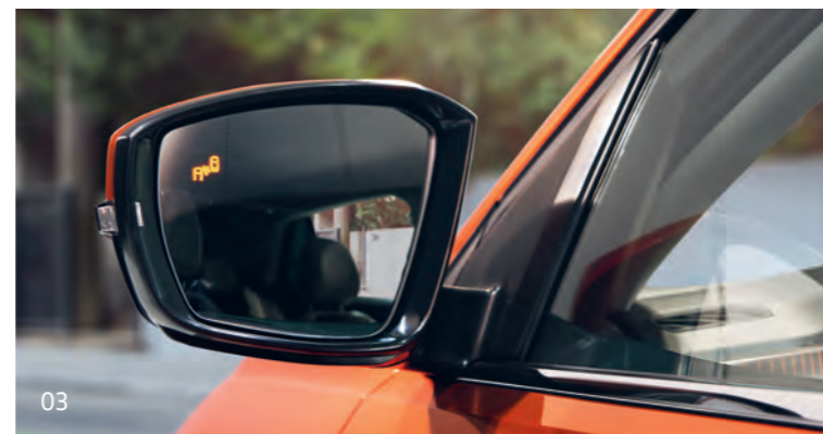
01 App-Connect- featuring Apple CarPlay®