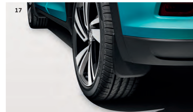
17 Mudflaps Front: Part.no 2GM075101 Rear: Part.no 2GM075111