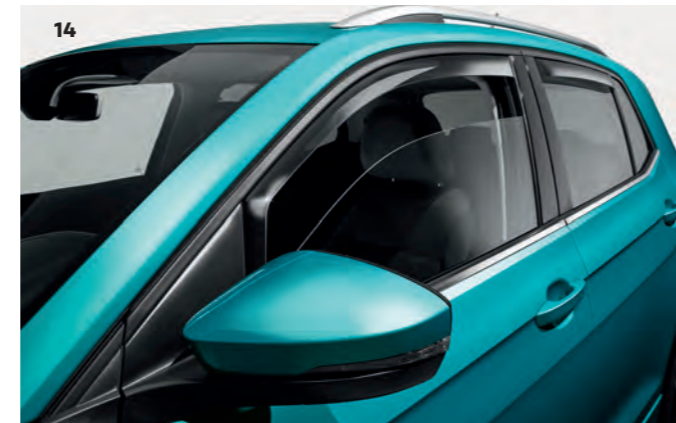
14 Slimline weathershields Enjoy the circulating fresh air, even when it is raining or snowing, or avoid the unpleasant build-up of heat on hot days by opening the windows slightly.

Front: Part.no 2GM072193 Rear: Part.no 2GM072194