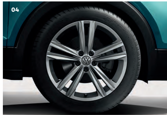
04 Sebring alloy wheel 17" Sebring wheel in grey metallic finish. Part.no 2GM071498FZZ