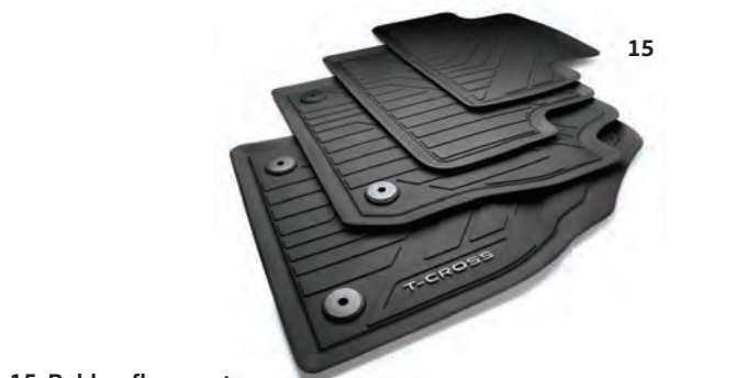
15 Rubber floor mats Keeping the footwell clean all year round: The perfectly fitting and durable floor mat set with T-Cross lettering on the front mats are attached to the vehicle floor using the integrated fastening system to prevent slipping.

Front: Part.no 2GN06150282V Rear: Part.no 2GM06151282V