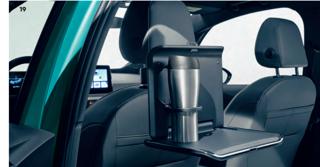
19 Folding table with cup holder The Volkswagen folding table with built-in cup holder is especially useful on long journeys and offers the rear passengers a practical surface with height and angle adjustment.