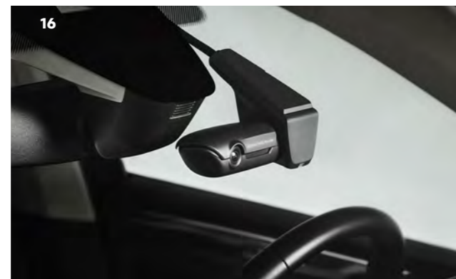
16 Universal Traffic Recorder Front: 000063511D Front & Rear: 000063511E

Front: Part.no 2GN06150282V Rear: Part.no 2GM06151282V