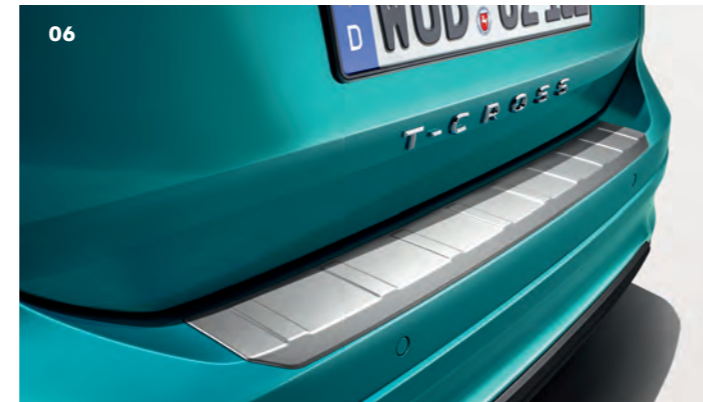
06 Loading sill protection plate The loading sill protection in stainless steel provides instant, stylish protection for an even more premium look to your vehicle. Part.no 2GM061195