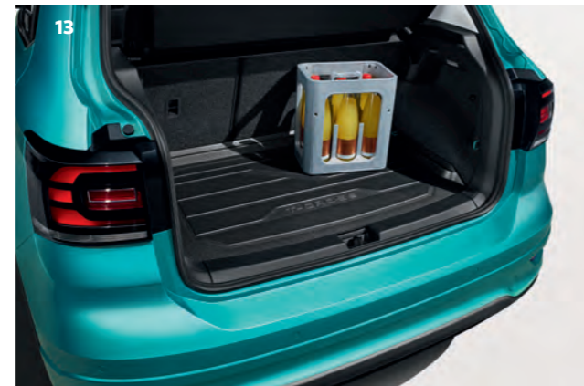
13 Luggage compartment tray A perfect fit: Can be wiped clean and is acid-resistant, the robust and durable luggage compartment tray with T-CROSS lettering easily keeps your luggage compartment clean.