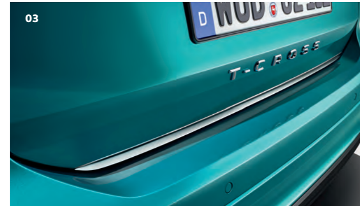
03 Tailgate protective strip The protection strip in high-gloss chrome protects the tailgate edges and adds to the appearance of the vehicle. Part.no 2GM071360