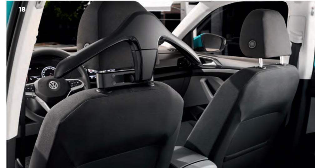
18 Coat Hanger Meet your business needs. The Volkswagen coat hanger provides crease-free transport of your clothing with a removable function as well.

Front: Part.no 2GM072193 Rear: Part.no 2GM072194