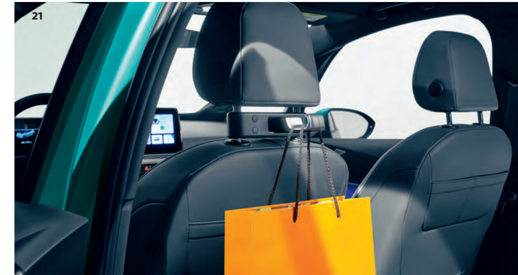
21 Bag Hook Part.no 000061126B

*For tablet holders, please contact your local Volkswagen dealer for compatible devices.