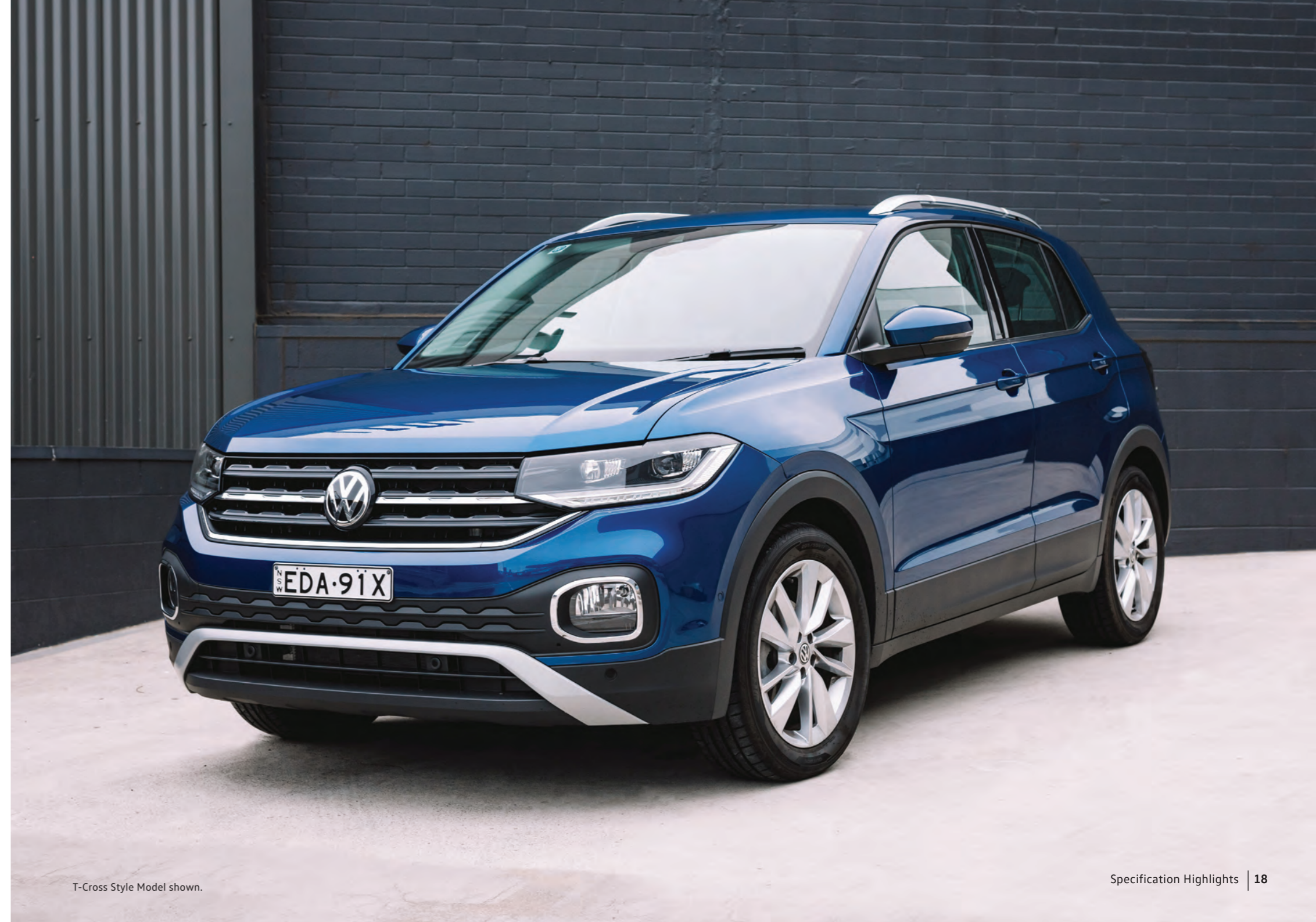
T-Cross Style Model shown.