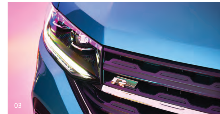
01 Optional Sound & Vision package shown