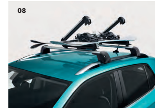
08 Ski and snowboard carrier When it comes to top of the mountain, there's nothing better on top. You can take up to six pairs of skis or up to four snowboards on the roof of your vehicle, comfortably and safely. The lockable ski and snowboard holder can quickly be mounted on the roof bars and is easy to operate.