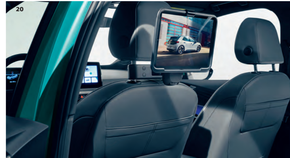
20 Tablet Holder The Volkswagen innovative Travel & Comfort system has a basic module that is simply fixed between the front seat headrest mountings and can be used with various tablet holder attachments which brings comfort and convenience to any journey. Please contact your local Volkswagen dealer for compatible devices.

*For tablet holders, please contact your local Volkswagen dealer for compatible devices.