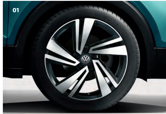
01 Nevada alloy wheel 18" Nevada wheel in gloss machined look. Part.no 2GM071497Z49