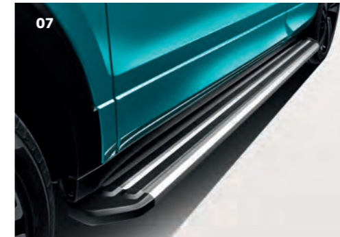
07 Side Steps Part.no 2GM071691