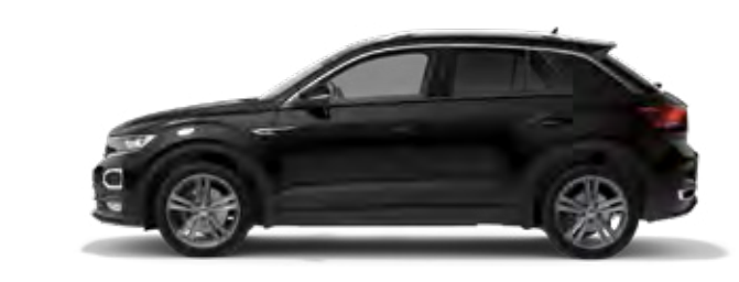
Deep Black Pearl Effect