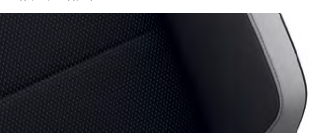
Black-Ceramique sports cloth seat upholstery