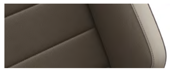
Quartzite-Ceramique Vienna leather appointed seat upholstery#