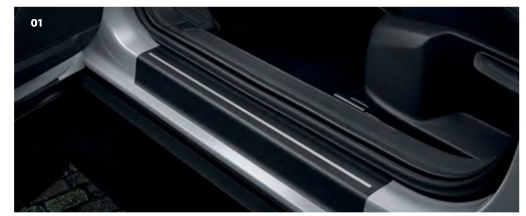
01 Door sill protection film

A detail which is both sensible and functional to protect the heavily used door sills in the front and rear entrance areas against scratches and damage.