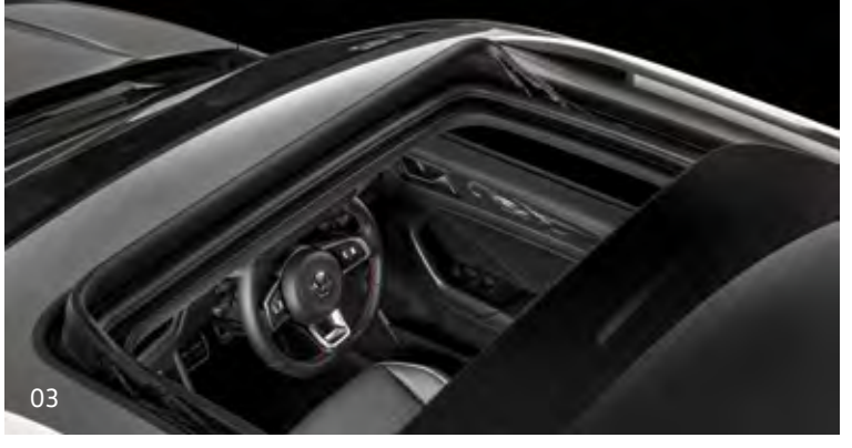
01 Beats audio system (part of Sound & Vision and Sound & Style packages)