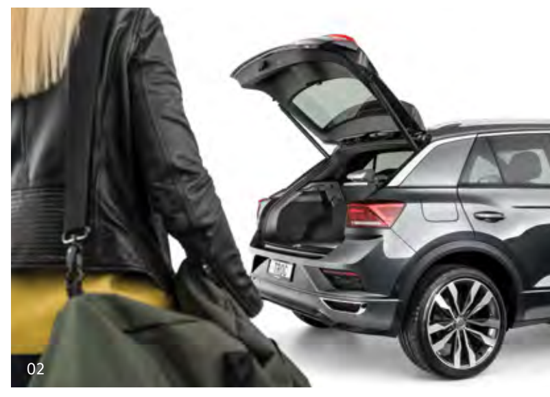
01 140TSI Sport Interior 02 Spacious luggage capacity