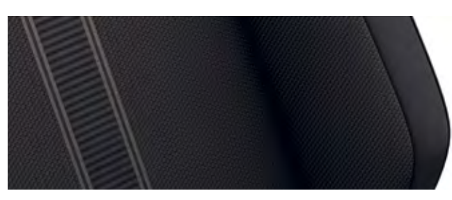
Black Oak-Ceramique comfort cloth seat upholstery