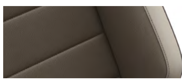
Quartzite-Ceramique Vienna leather appointed seat upholstery#