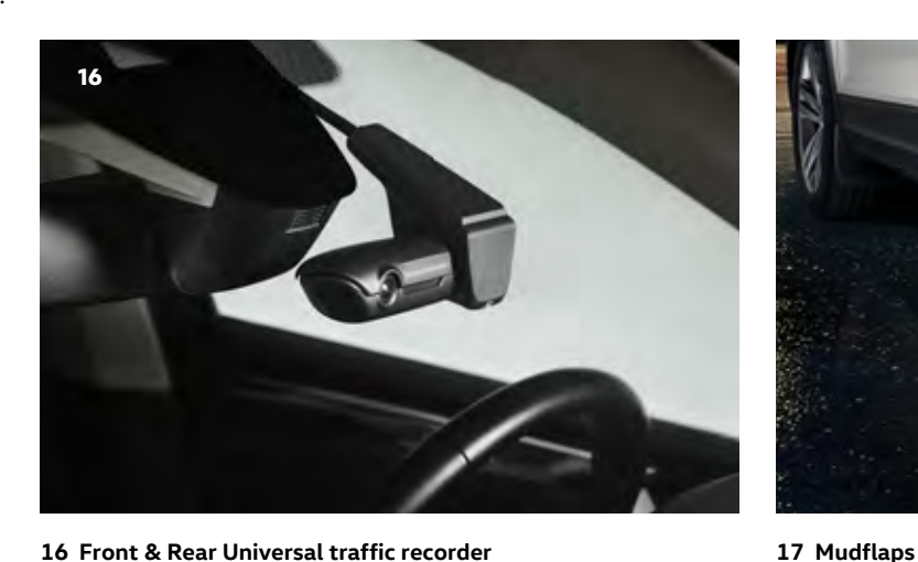
16 Front & Rear Universal traffic recorder