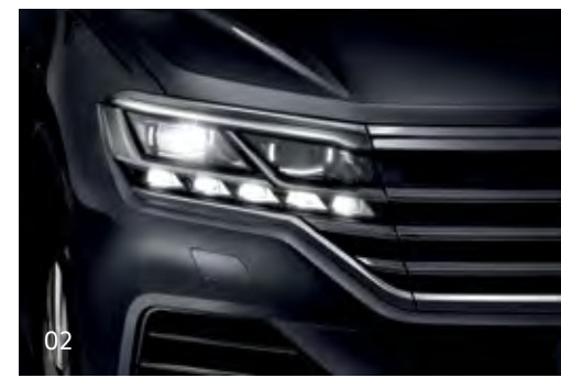
01 App-Connect<sup>~</sup> USB Interface02 IQ. Light Matrix LED headlights