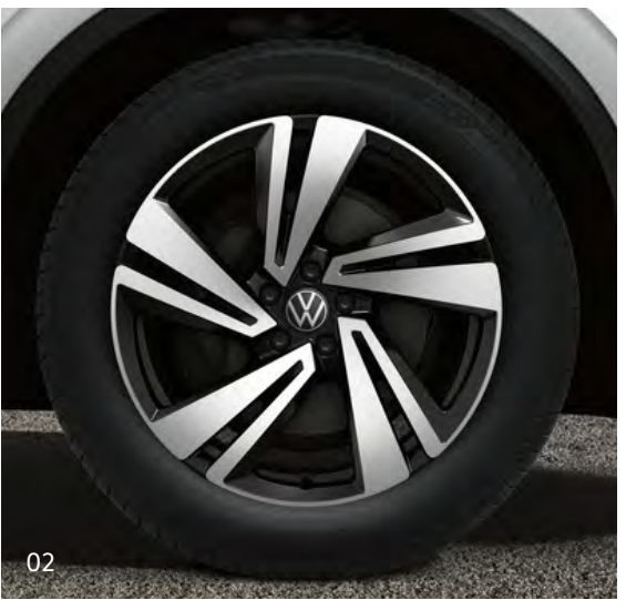
01 Rear tail lights, Premium LED with dynamic turn signals02 20" Nevada alloy wheel