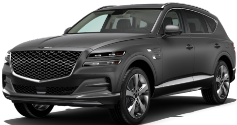
MAKALU GRAY MATTE