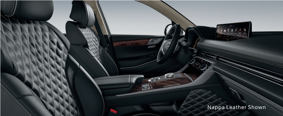
BLACK/BLACK WITH OLIVE ASH WOOD TRIM