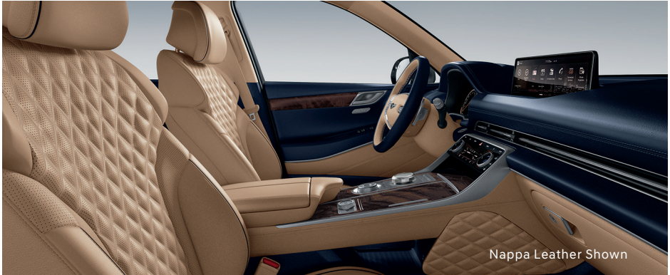
ULTRAMARINE BLUE/DUNE WITH OLIVE ASH WOOD TRIM