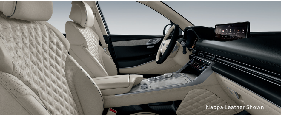
BLACK/BEIGE WITH METALLIC POREFILLER ASH WOOD TRIM