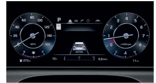
10.25" TFT LCD supervision cluster 1 provides you with vital driving info, while you stay focused on the road.