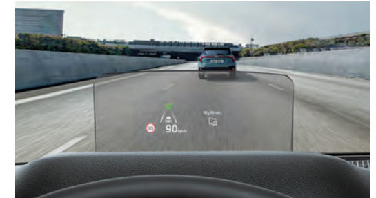
Heads-up display (HUD) 1 subtly projects key driving information on a secondary screen above the steering wheel.