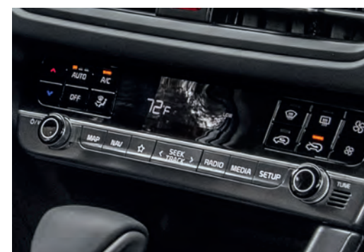
Automatic climate control 1 lets you set your ideal cabin temperature.

The new Seltos tells a story of roominess and comfort, featuring standard heated front seats and available amenities that include automatic climate control, beautiful Sofino leather seating and a convenient driver seat memory function.