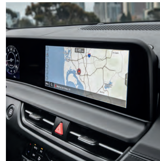
10.25" multimedia interface 1,4 with integrated touch-screen navigation.

The cabin of the new Seltos is built around the driver, emphasizing clean design, excellent sightlines and intuitive control over every element of the driving experience.