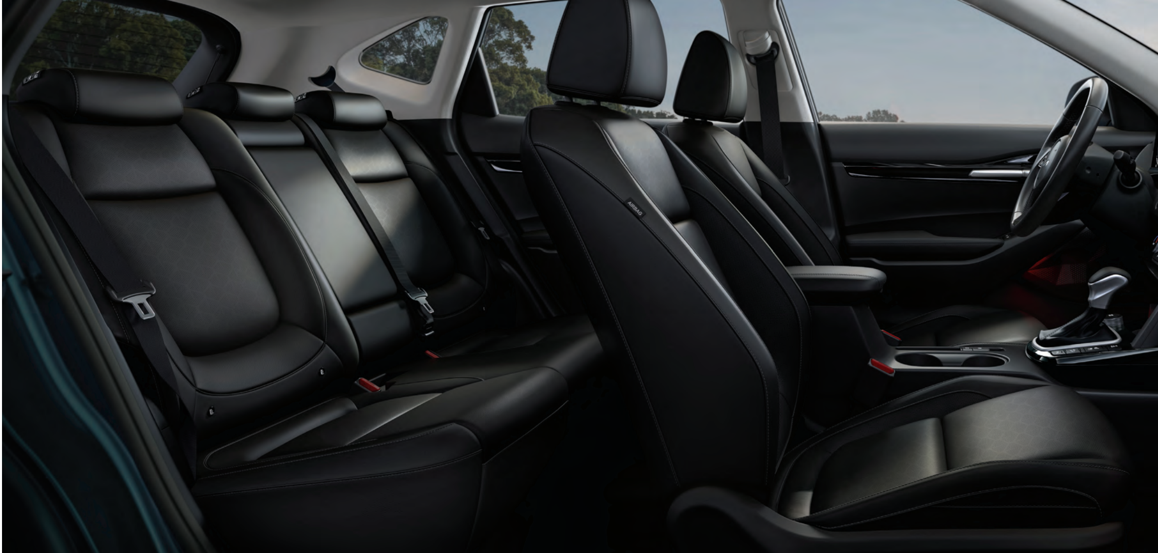
EX Premium model shown.