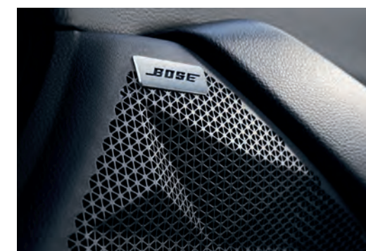
Bose premium audio 1,10 delivers crystal clear and balanced sound.