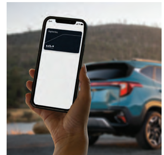
Digital Key 2 Touch 1,11 makes your smartphone your car key. It also lets you transfer a secure digital key to others who may need to drive the vehicle.