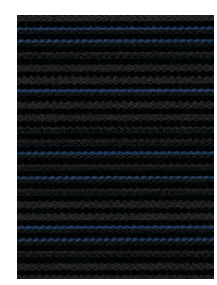
Black Cloth S SV PLUS