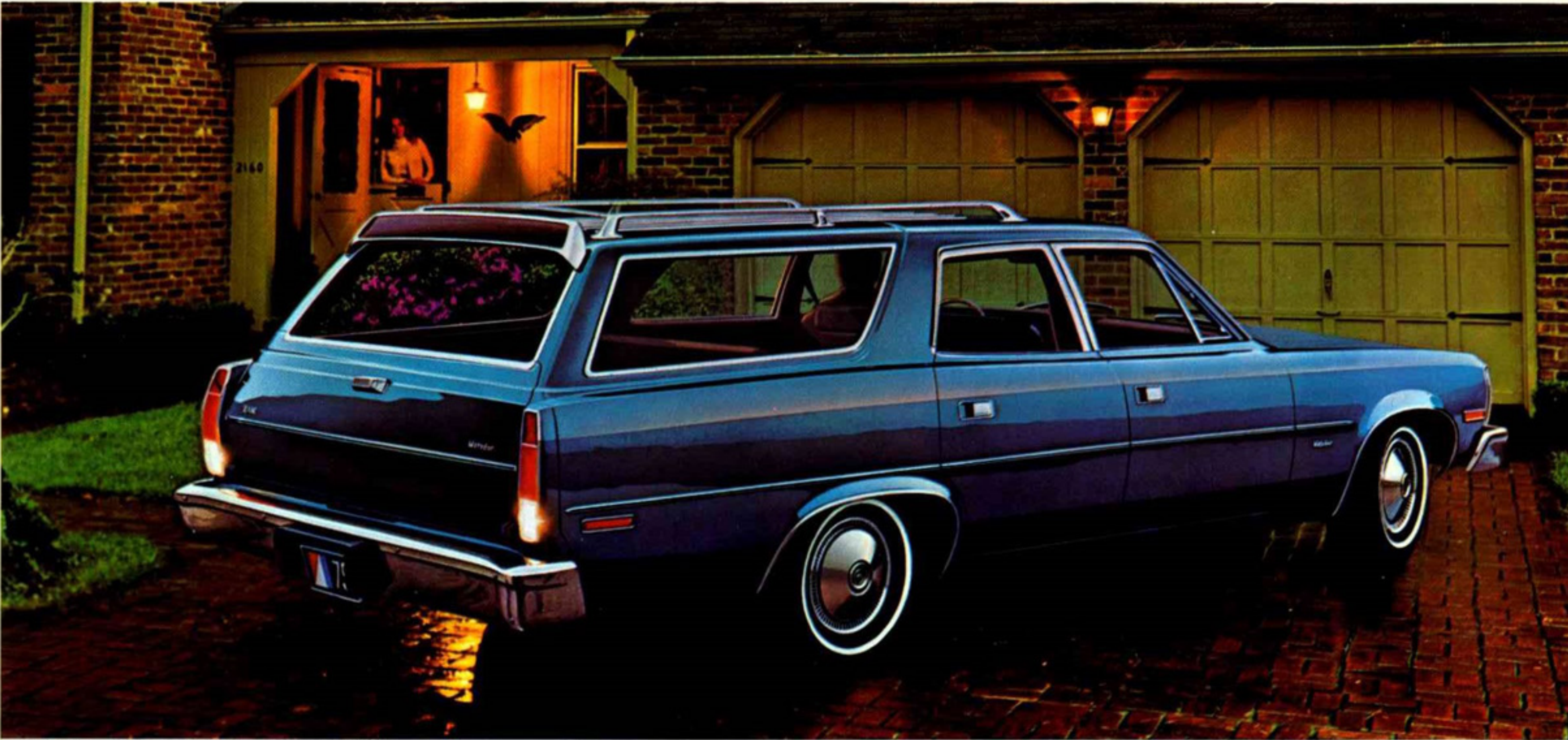
Matador Wagon in G9 Medium Blue Metallic.