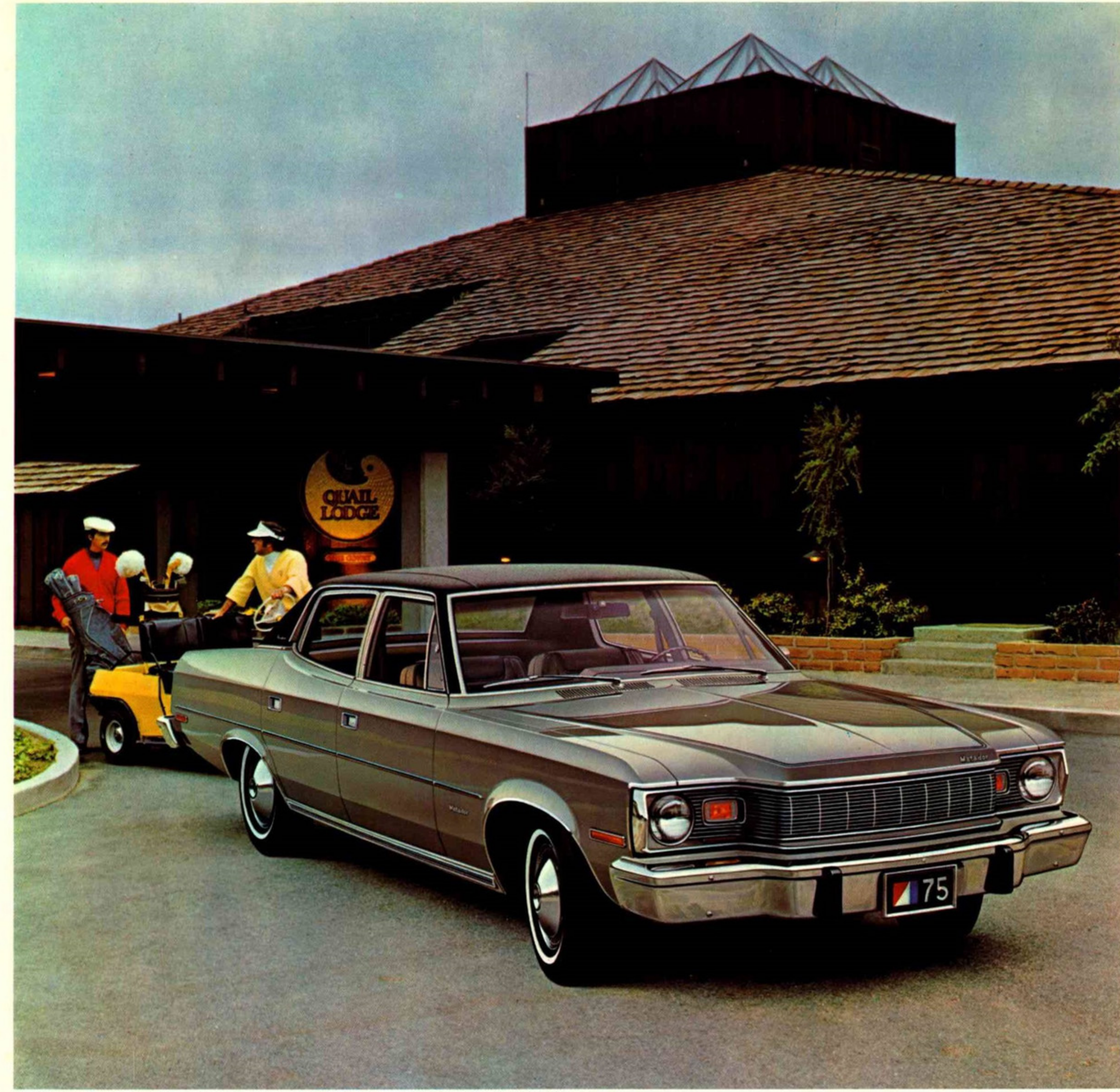
Matador Brougham 4-Door-Sedan in H9 Silver Dawn Metallic with black vinyl roof option.