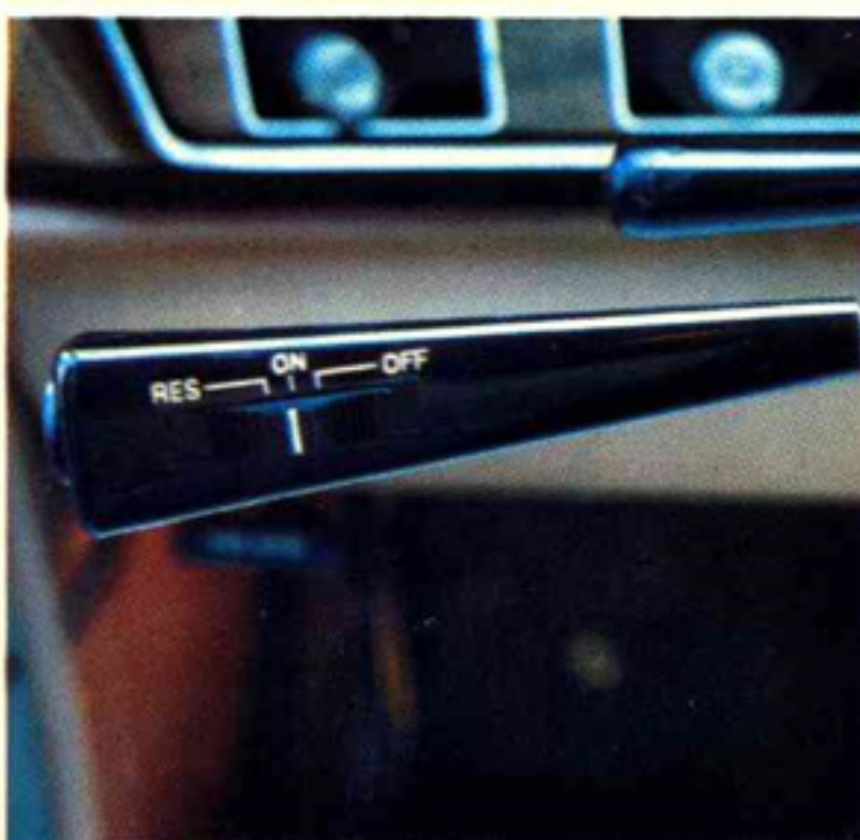
Cruise-Command automatic speed control. Lets you set desired speed for steady, "foot-off-the-gas" cruising. Ideal for trips, long freeway runs.