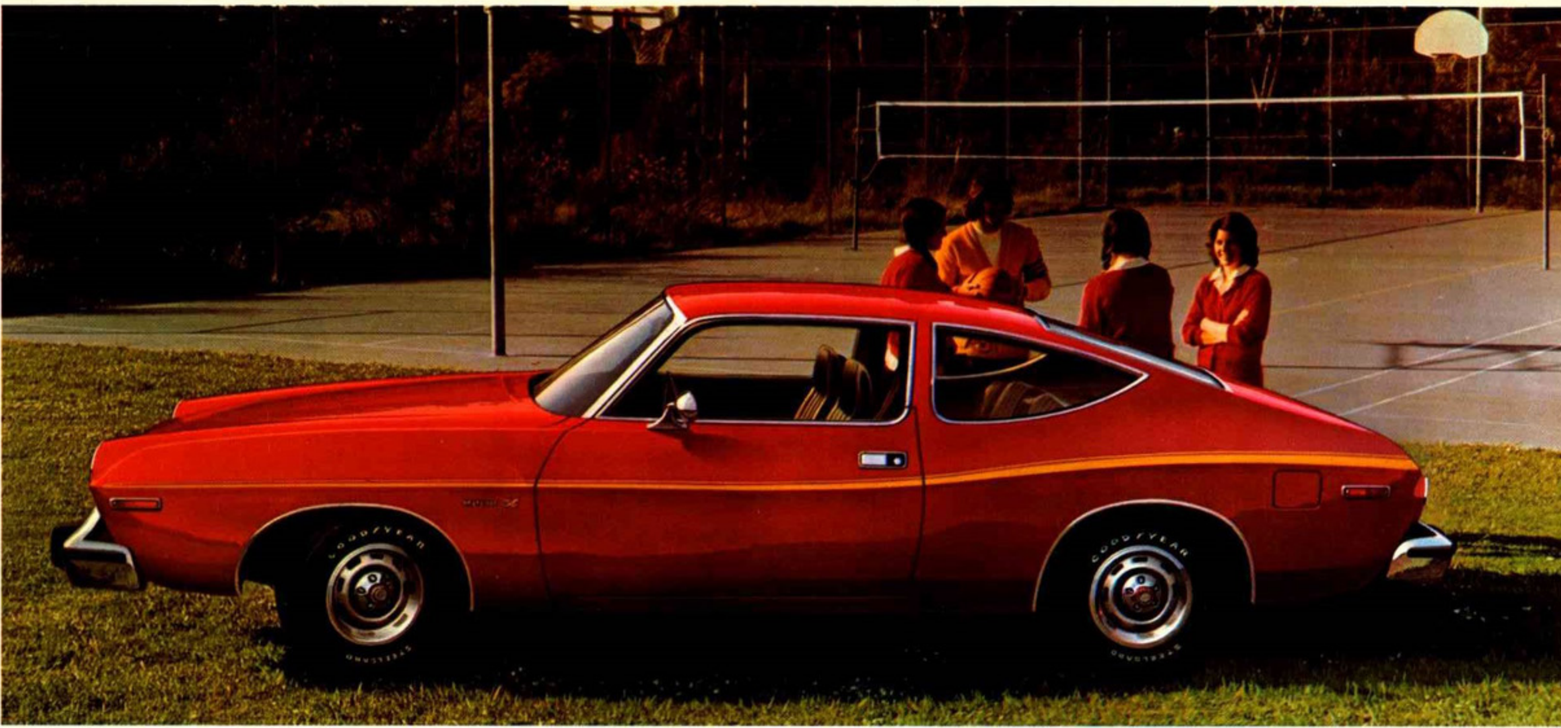
Matador X in H8 Autumn Red Metallic.