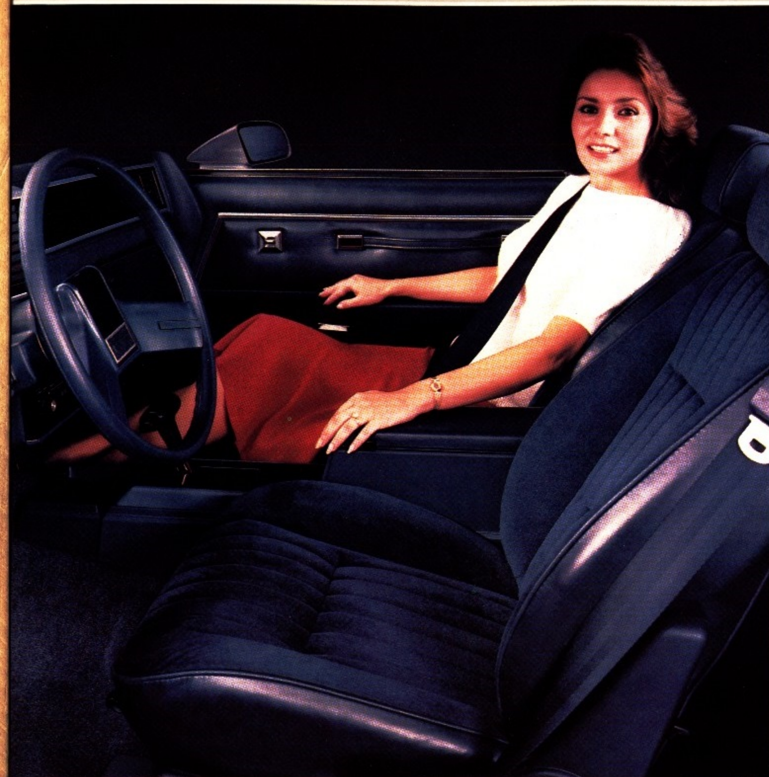
Available high-back bucket seats with velour cloth upholstery. Shown with available center console.

Caballero is a unique blend of sophisticated mid-size luxury passenger car and brawny hardworking pickup truck...and exclusive Sedan Pickup from GM.