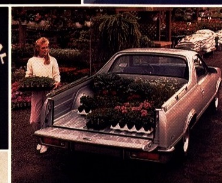
Impressive amount of cargo is easily loaded into the 79.5"-long, 35.5-cu-ft box.

Caballero...extraordinary combination of prestigious style and truck-tough muscle. Tires are supplied by various manufacturers.