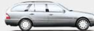
C200 / C240