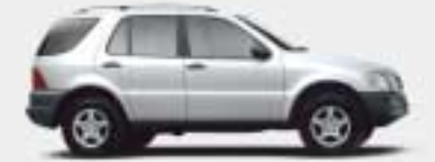
ML270 CDI / ML320 / ML430 / ML55