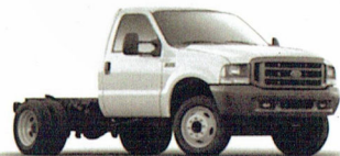
F-350 Super Duty chassis cab.