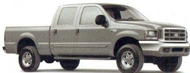
F-250 Super Duty Crew Cab.