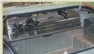
REAR COMMUNICATIONS SERVICE TRAY