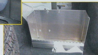
PASSENGER-SIDE STORAGE BOX

For Additional Information, Call Us Toll-Free at 1-800-34-FLEET or Visit Our Web Site at www.fleet.ford.com .