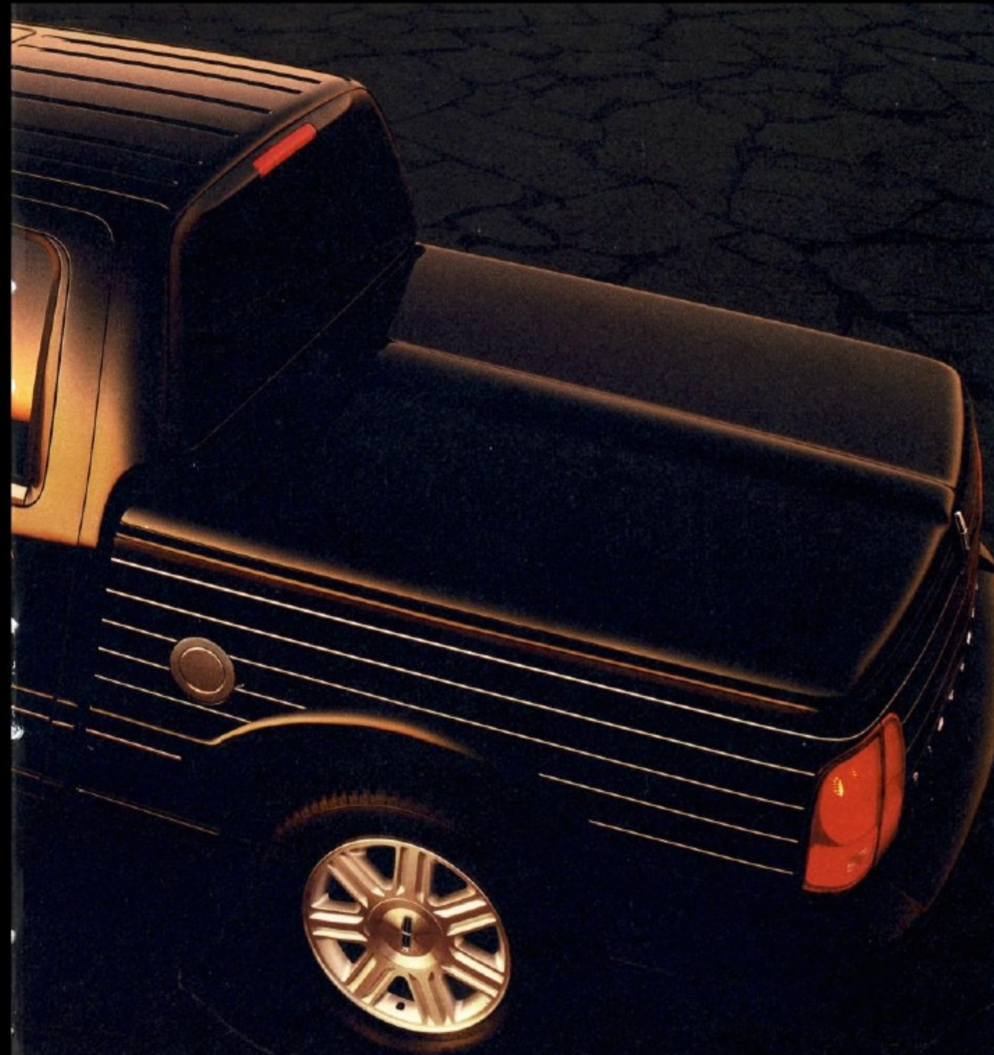
Lincoln Blackwood in Black Clearcoat.