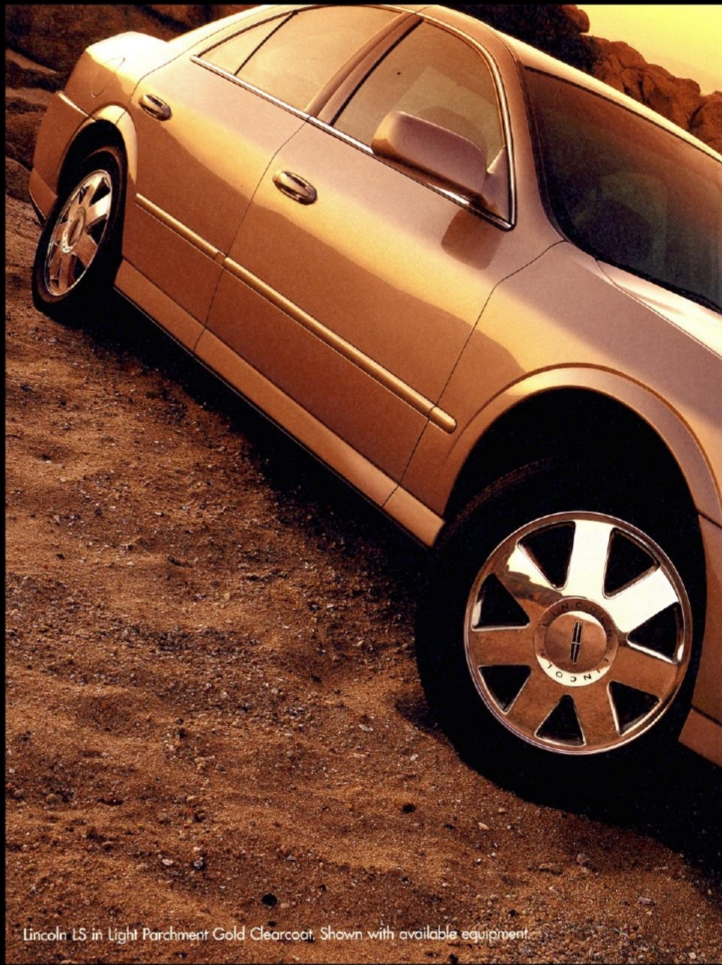
Lincoln LS in Light Parchment Gold Clearcoat. Shown with available equipment.