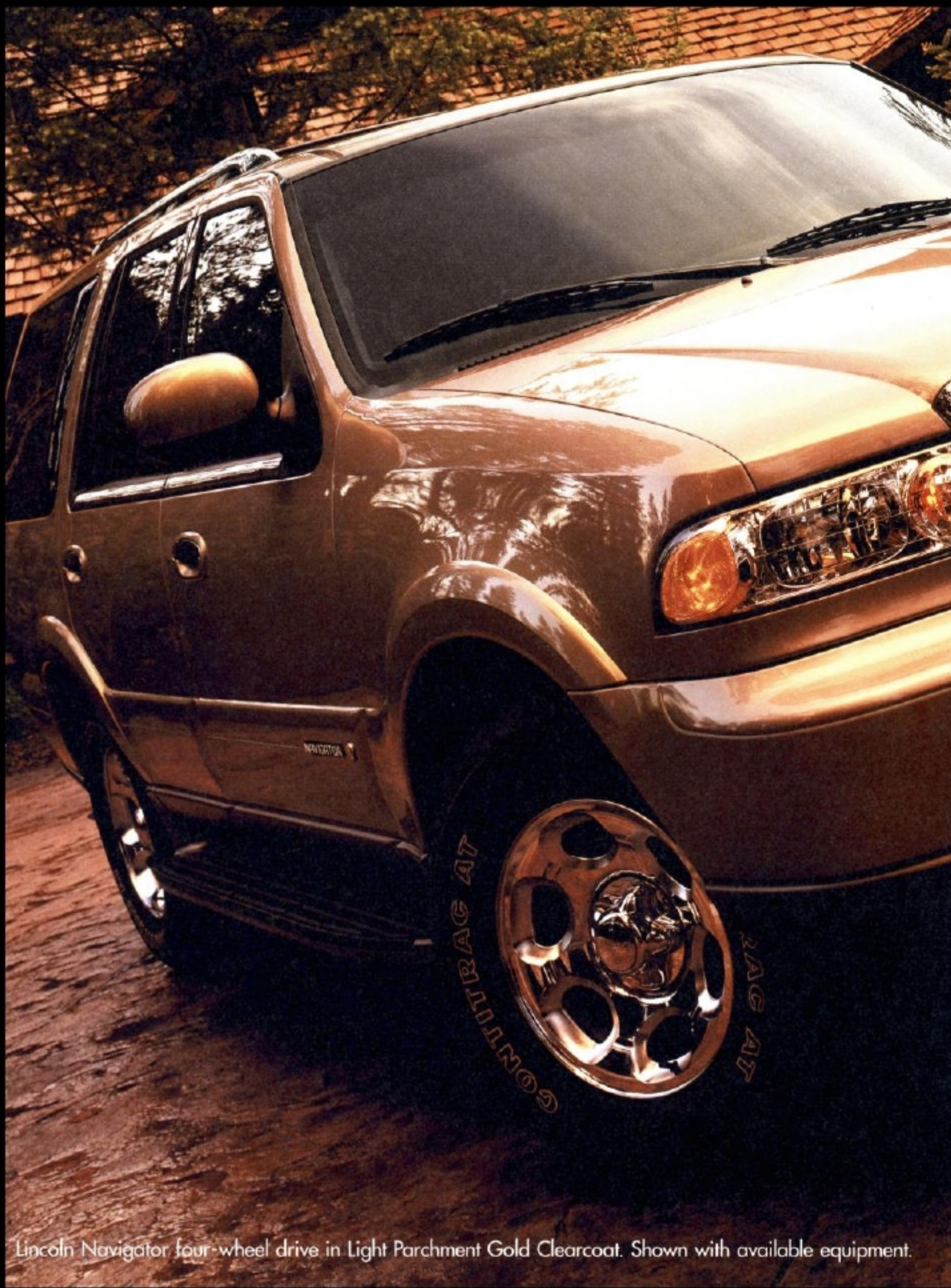
Lincoln Navigator four-wheel drive in Light Parchment Gold Clearcoat. Shown with available equipment.