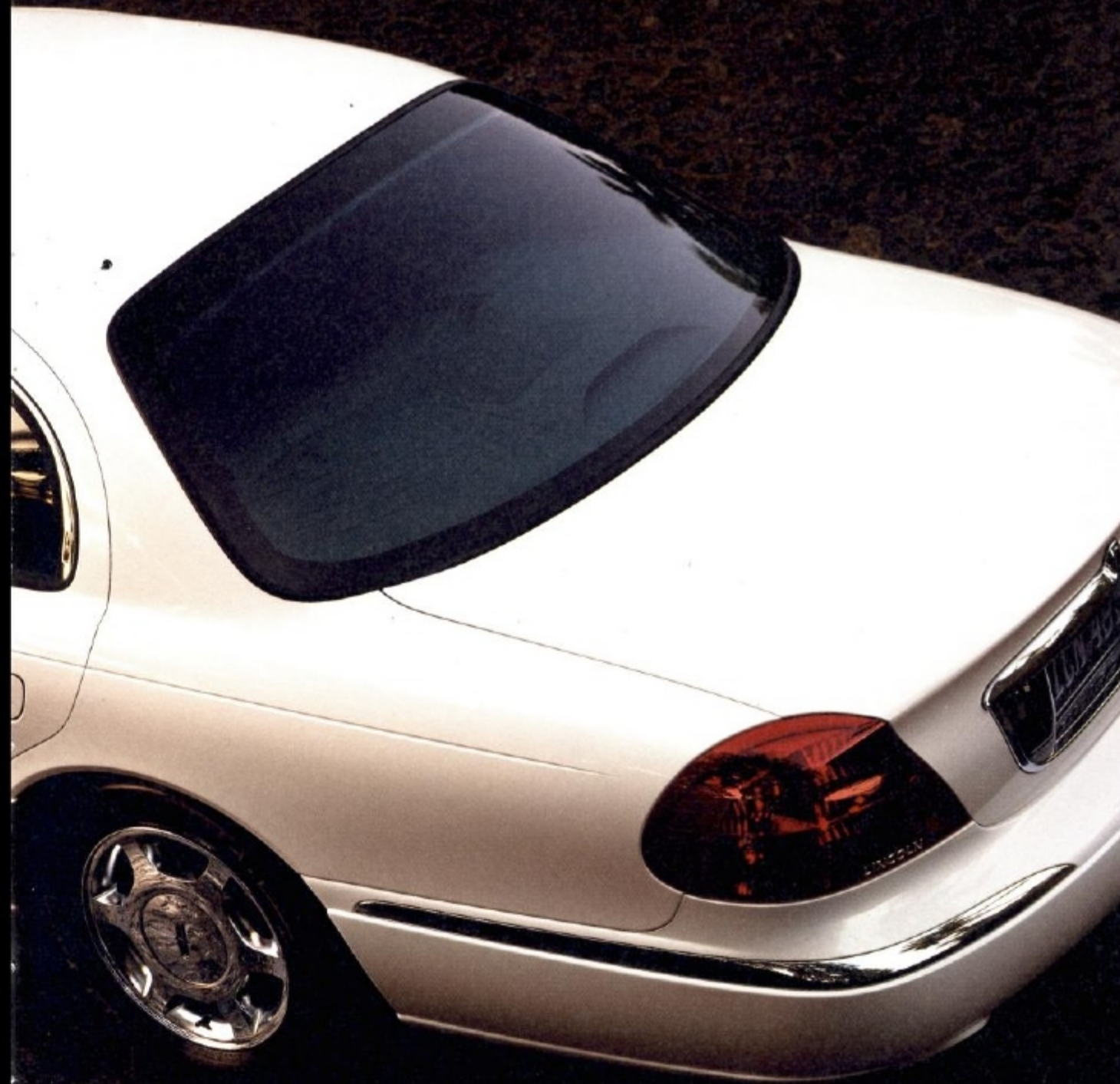
Lincoln Continental in White Pearlescent Clearcoat Metallic. Shown with available equipment.