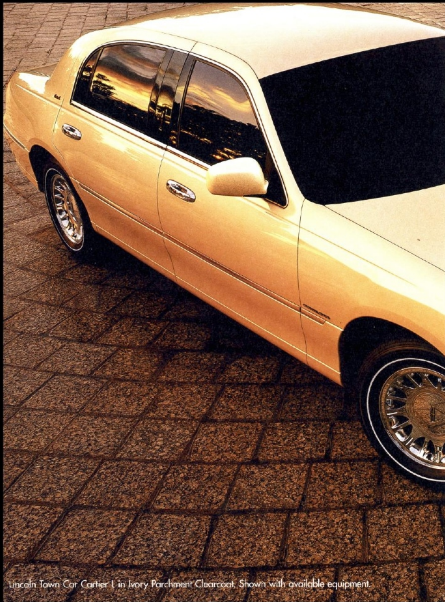
Lincoln Town Car Cartier L in Ivory Parchment Clearcoat. Shown with available equipment.