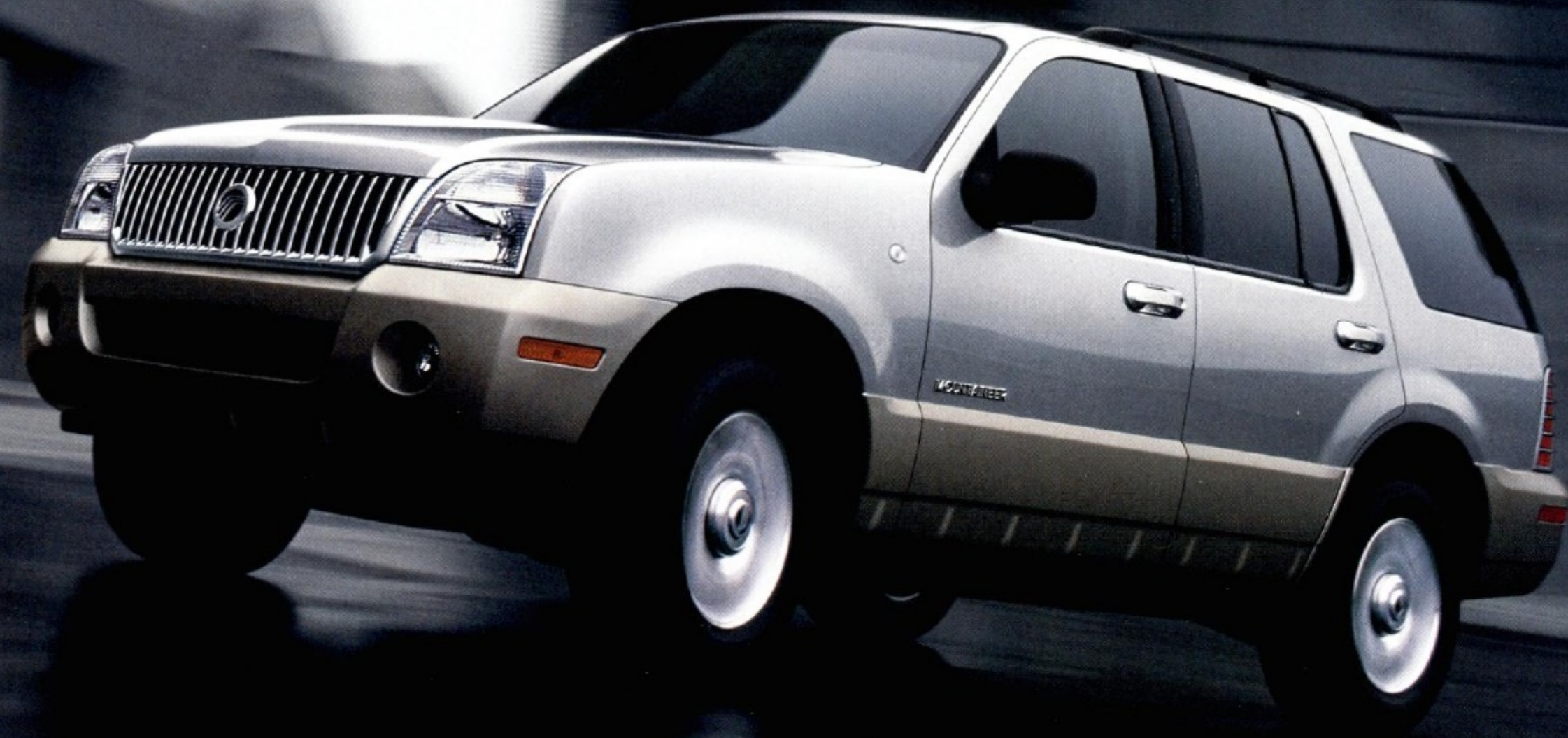
Mercury Mountaineer AWD in Silver Frost Clearcoat Metallic with Light Mineral Grey Clearcoat Metallic cladding. Shown with available equipment.