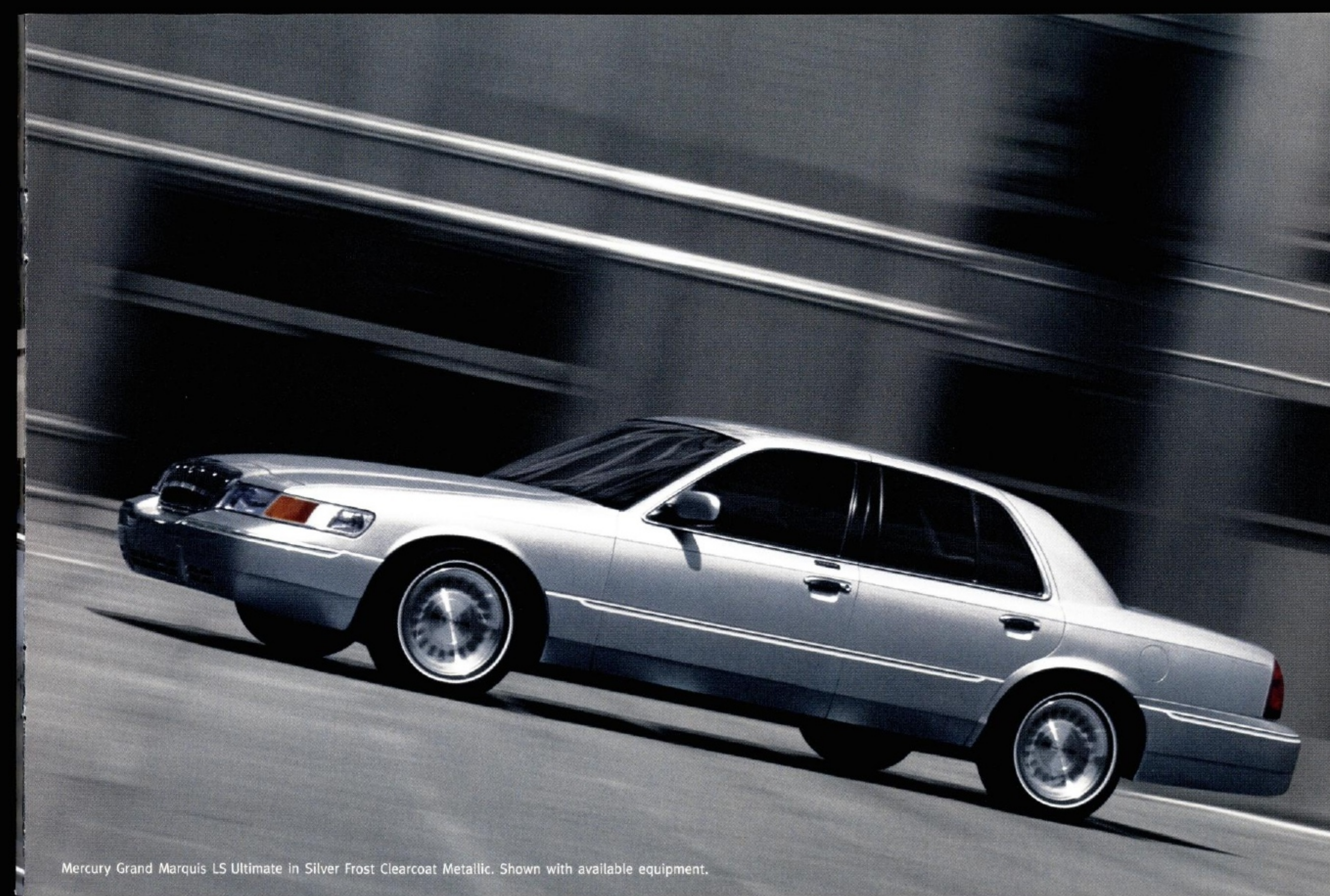
Mercury Grand Marquis LS Ultimate in Silver Frost Clearcoat Metallic. Shown with available equipment.