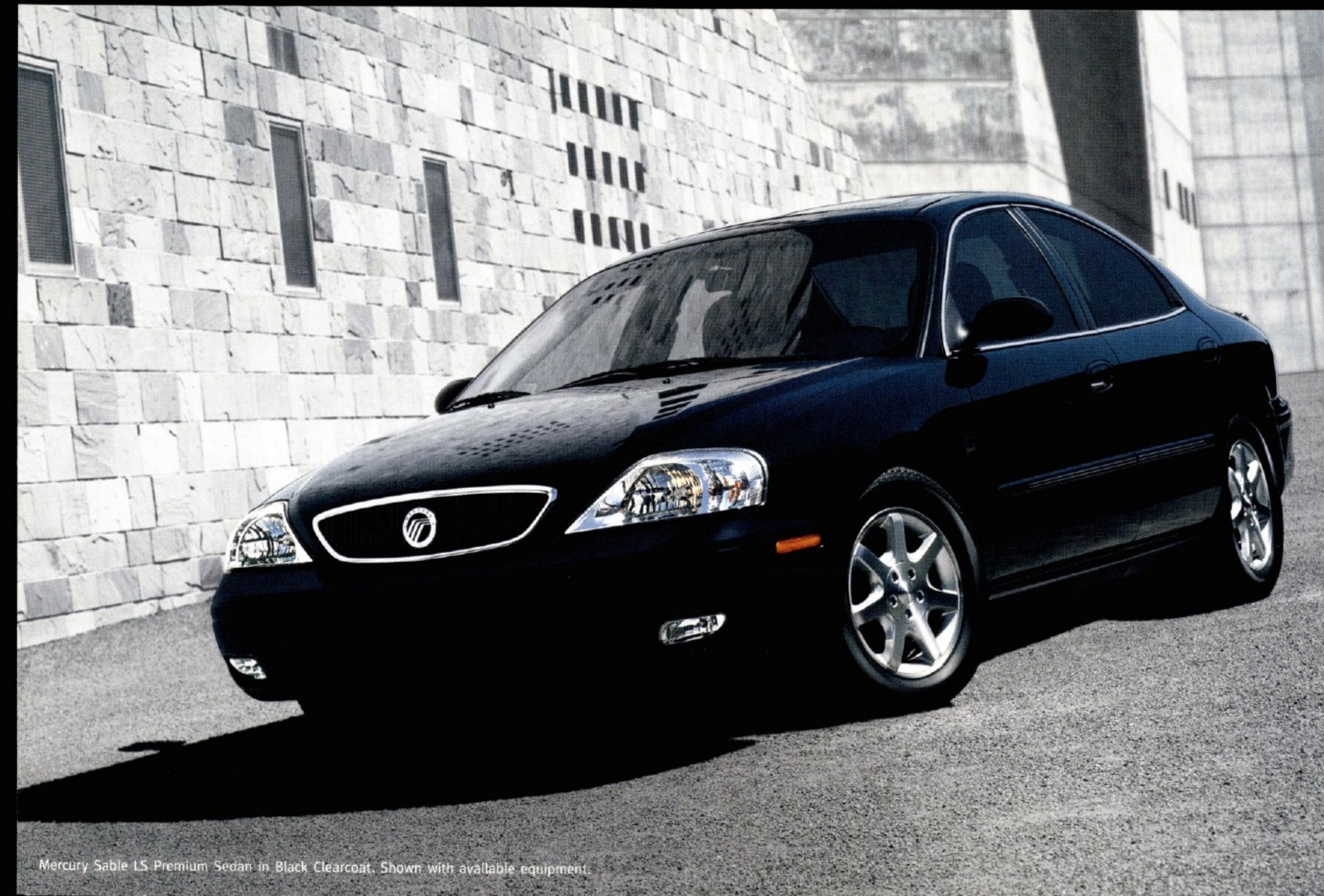
Mercury Sable LS Premium Sedan in Black Clearcoat. Shown with available equipment.