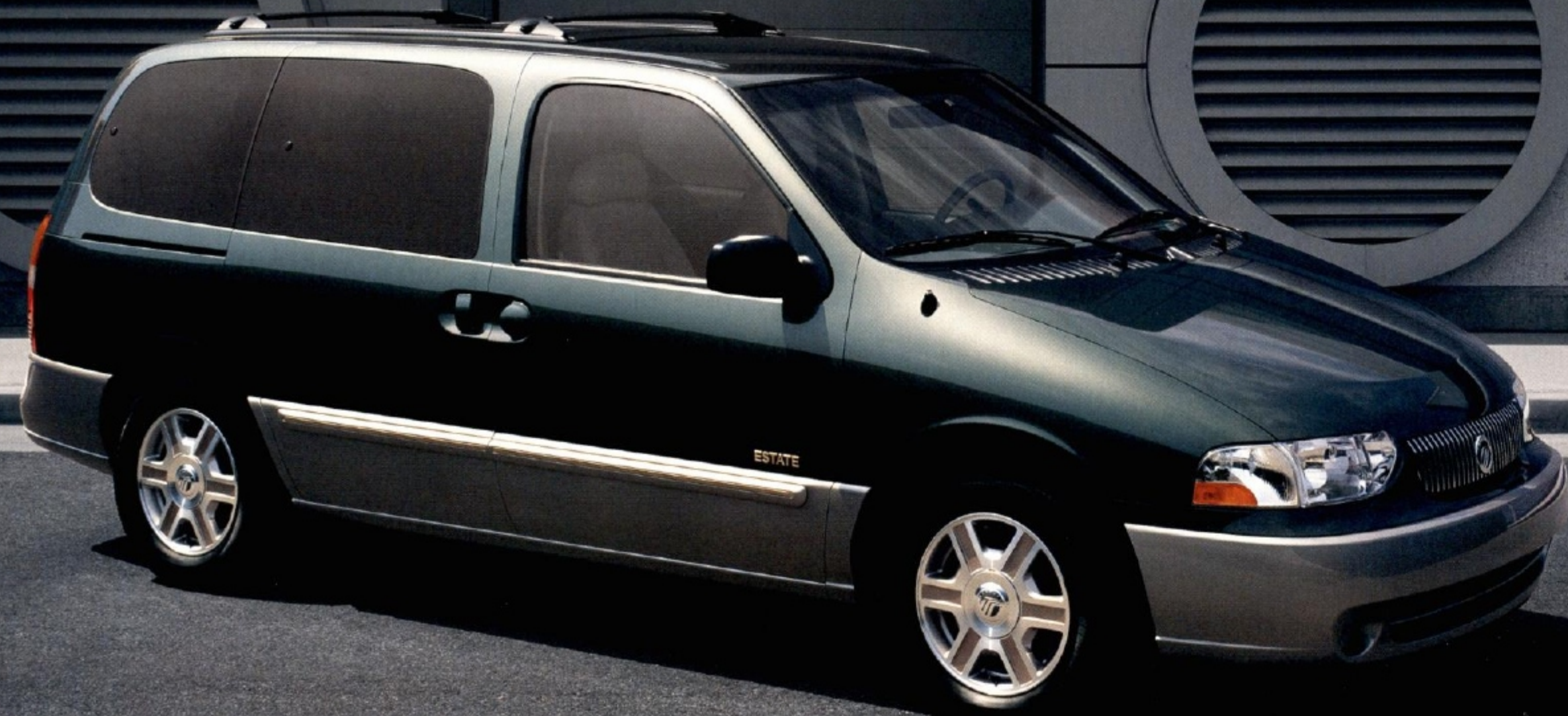
Mercury Villager Estate in Estate Green Clearcoat Metallic with Light Parchment Gold Clearcoat Metallic accent.