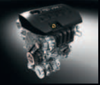
1.8 litre Dual VVT-i engine