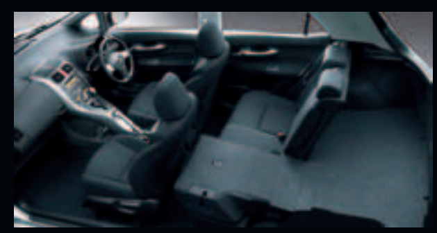
Levin ZR with 60:40 rear split

Available in four models – from the well-appointed entry level Ascent up through the generously specified Conquest, the sporty Levin SX and the top grade luxury sports Levin ZR – there's a Corolla Hatch to suit every driver's taste.