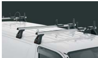
ROOF RACKS - STANDARD KIT Available on LWB