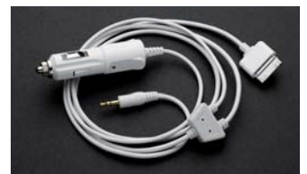
AUDIO CABLE AND CAR CHARGER ^ FOR IPOD ® Available on selected models where AUX-In option is part of audio unit. Suits iPod ® models that have a dock connector*

^ This accessory is not a Toyota Genuine Accessory (supplier branded) and is warranted for 12 months from the date of purchase. This warranty is additional to the implied warranties under the Trade Practices Act 1974.