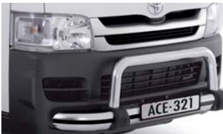
ALLOY NUDGE BAR Available on all models

THESE ARE JUST SOME OF THE ACCESSORIES AVAILABLE FOR YOUR HIACE. FOR A COMPLETE LIST AND FURTHER DETAILS, PLEASE SEE YOUR TOYOTA DEALER OR REFER TO OUR WEBSITE.