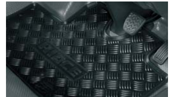
ALL WEATHER RUBBER FLOOR MATS Available on all models