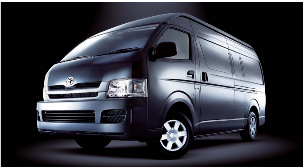
Super Long Wheel Base model shown.