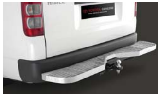
TOWBAR WITH TECHNICIAN STEP Available on LWB