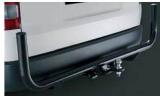
TOWBAR WITH REAR CORNER PROTECTOR Available on all models