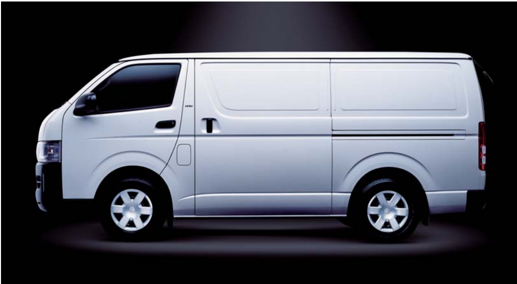
Long Wheel Base model shown.