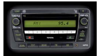
6 DISC IN-DASH MP3 COMPATIBLE CD CHANGER WITH BLUETOOTH ™† COMMUNICATIONS AND AUDIO INPUT Available on all models