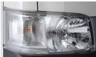
HEADLAMP COVERS Available on all models