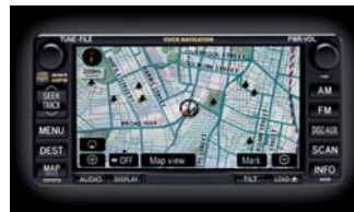
SATELLITE NAVIGATION ^ AUDIO SYSTEM INCLUDING 4 DISC IN-DASH MP3 COMPATIBLE CD CHANGER WITH BLUETOOTH ™† COMMUNICATIONS AND (OPTIONAL) AUDIO INPUT Available on all models