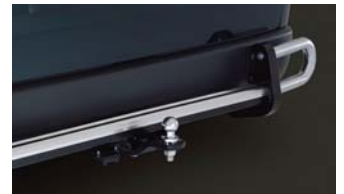
TOWBAR WITH REAR STEP AND PROTECTOR Available on all models