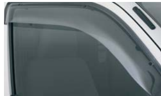
FRONT WEATHERSHIELDS Available on all models