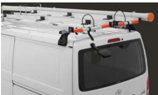
ROOF RACKS - FULL TECHNICIAN KIT Available on LWB