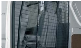
CARGO BARRIER Available on LWB & SLWB