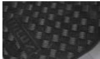
ALL WEATHER RUBBER FLOOR MATS FRONT AND REAR AVAILABLE (SOLD SEPARATELY)