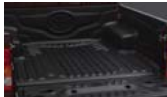
UTE LINER AND TAILGATE LINER