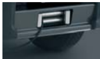
SUPERWINCH (9000lb CAPACITY)