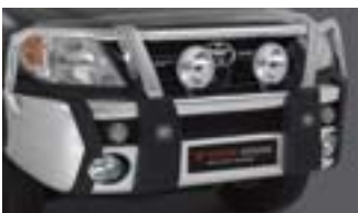
4X4 FORGE ALLOY BULL BAR - WITH OPTIONAL DRIVING LIGHTS (SOLD SEPARATELY)