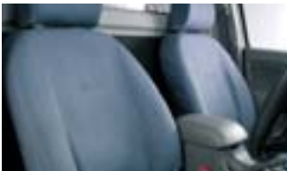
CANVAS SEAT COVERS