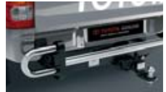
TOWBAR WITH REAR STEP (2250kg Braked) TOWBALL AND TRAILER WIRING HARNESS (SOLD SEPARATELY)