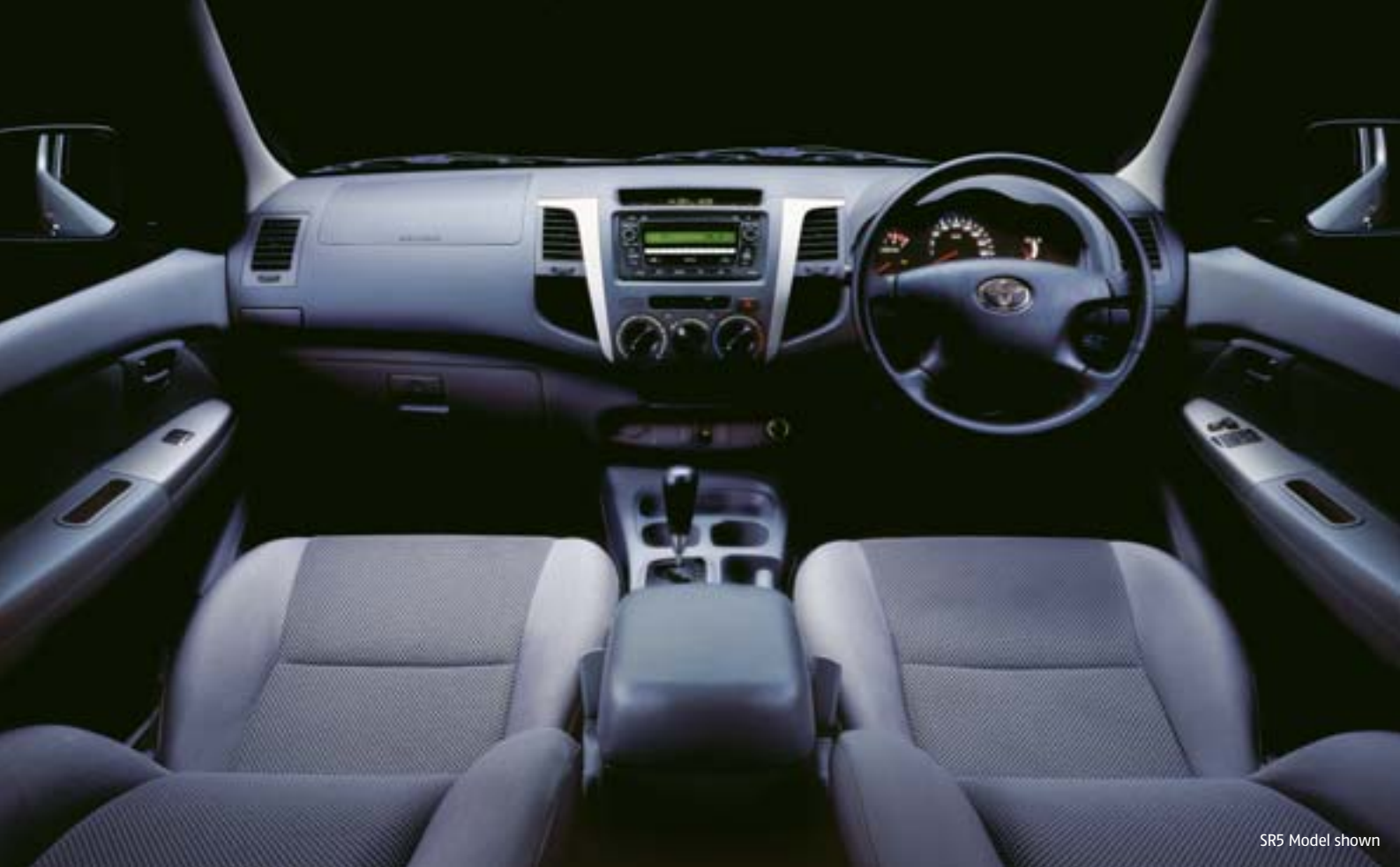
SR5 Model shown