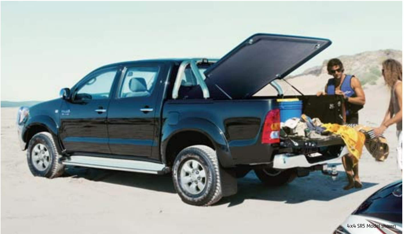
4x4 SR5 Model shown