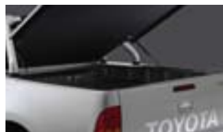
HARD TONNEAU COVER