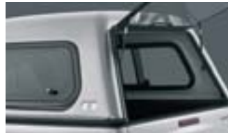
CANOPY (HIGH ROOF)