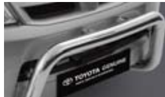
ALLOY NUDGE BAR - AIRBAG COMPATIBLE