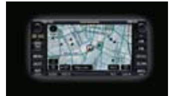
SATELLITE NAVIGATION** AUDIO SYSTEM INCLUDING 4-IN-DASH MP3 COMPATIBLE CD CHANGER WITH BLUETOOTH™ COMMUNICATIONS