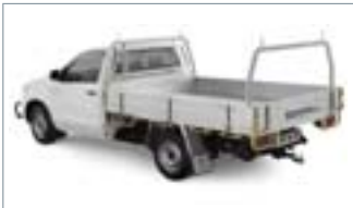
ALLOY TRAY BODY WITH OPTIONAL REAR RACK AND ALLOY WINDOW PROTECTOR FITTED

THESE ARE JUST SOME OF THE ACCESSORIES AVAILABLE FOR YOUR HILUX. FOR A COMPLETE LIST AND FURTHER DETAILS, PLEASE SEE YOUR TOYOTA DEALER OR REFER TO OUR WEBSITE.