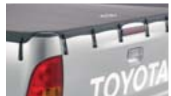
SOFT TONNEAU COVER