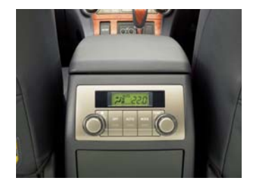
3 zone climate control air conditioning. Grande model shown.