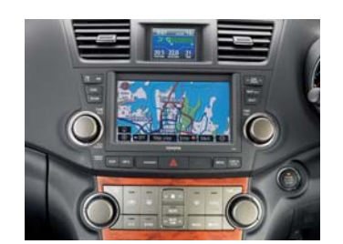
Satellite Navigation & Multi-function Information Display (MID). Grande model shown.

And with up to seven seats, the New Kluger offers loads of versatility and ample comfort, with its roomiest interior yet.