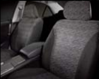
SEAT COVERS. Grey – Front & Rear (Sold Separately). Available for AT-X only.