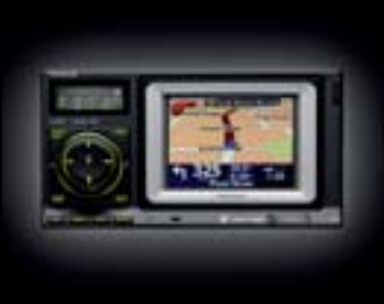
FOLLOWME SOUND & NAVIGATION SYSTEM^ – Includes single in-dash MP3 CD Changer and Radio with Bluetooth™† Handsfree Communications, USB IN and (optional) iPod® Control* Available for AT-X, Prodigy, Sportivo SX6 & ZR6.