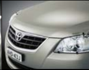
BONNET PROTECTOR & HEADLAMP COVERS (Sold Separately). Available for all Aurion grades.