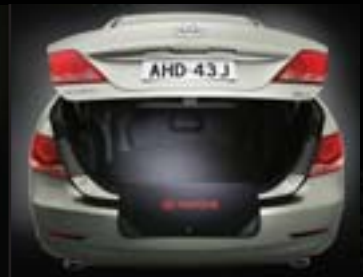
SCUFF GUARD. Available for all Aurion grades.