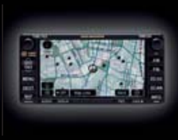
SATELLITE NAVIGATION AUDIO SYSTEM^ – Includes 4 in-dash MP3 CD Changer & Radio with Bluetooth™† Handsfree Communications. Available for AT-X, Prodigy, Sportivo SX6 & ZR6.