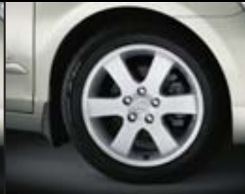
17" X 7" VORTEX – V ALLOY WHEELS. Available for all Aurion grades.