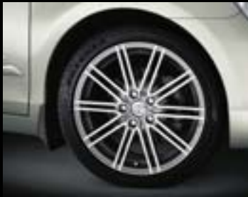
18" X 75" KAPPA ALLOY WHEELS. Available for all Aurion grades.