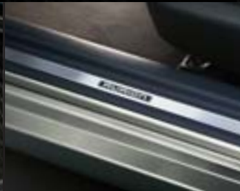
SCUFF PLATES (Front & Rear set – Sold Separately). Available to suit various interior trims for AT-X & Prodigy.