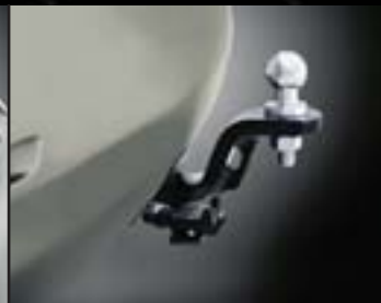
TOWBAR~ (1600kg braked capacity), TOWBALL & TRAILER WIRING HARNESS (Sold Separately). Available for all Aurion grades.