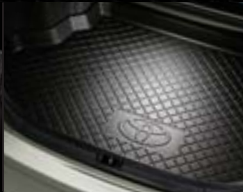
BOOT LINER. Available for all Aurion grades.