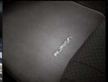
'AURION' CARPET FLOOR MATS (Front & Rear Set). Grey – Available for AT-X, Prodigy & Presara. Sandstone – Available for Prodigy & Presara. *SPORTIVO* Grey – Available for Sportivo SX6 & ZR6.