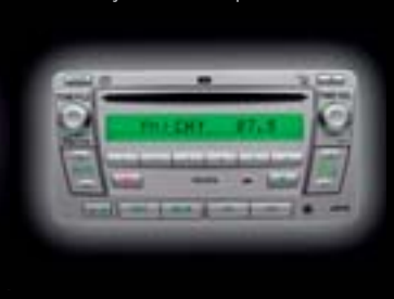
6 IN-DASH MP3 COMPATIBLE CD CHANGER & RADIO WITH BLUETOOTH™† HANDSFREE COMMUNICATIONS & AUXILIARY AUDIO INPUT (Audio Upgrade) Available for AT-X, Prodigy, Sportivo SX6 & ZR6