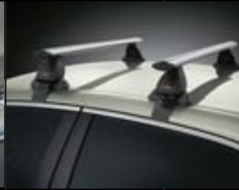
ROOF RACKS (2 Bar Set – 60kg maximum capacity). Available for all Aurion grades.