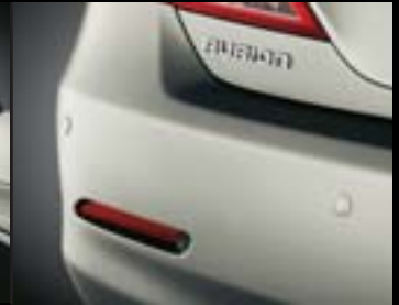
PARKASSIST** Reverse Parking Sensors (4 head kit) and Clearance Parking Sensors (2 head kit). Available for AT-X & Sportivo SX6.