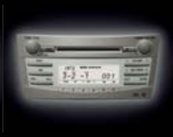
6 IN-DASH MP3 COMPATIBLE CD CHANGER & RADIO (Audio Upgrade). Available for AT-X model only.