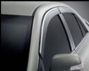
SLIMLINE WEATHERSHIELDS (Set of 4). Available for all Aurion grades.