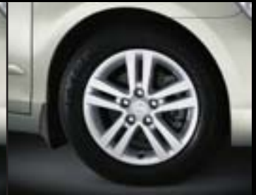
16" X 7" RAPTOR ALLOY WHEELS (Painted Finish). Available for AT-X & Prodigy.