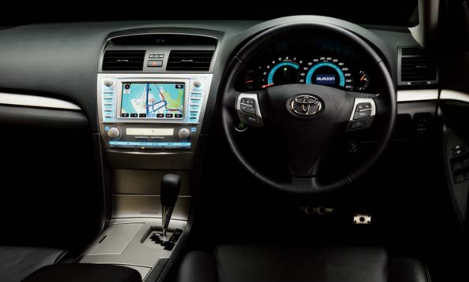
Sportivo ZR6 interior with optional Satellite Navigation* System shown.