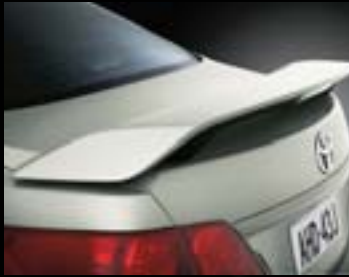
REAR SPOILER. Available for AT-X & Prodigy.

Now you can make some extra moves to enhance the styling and practicality of your Aurion with these Toyota Genuine Accessories. Designed to fit, engineered to perform. Choose all the right moves you want to make, then let your Aurion fit your life, and your style.