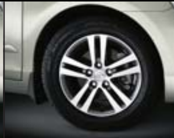
16" X 7" RAPTOR ALLOY WHEELS (Machined Finish). Available for AT-X & Prodigy.