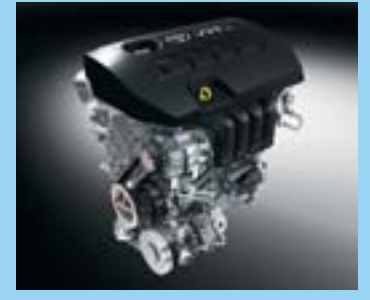
1.8 litre Dual VVT-i engine