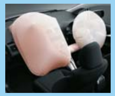
Dual front and driver's knee SRS airbags