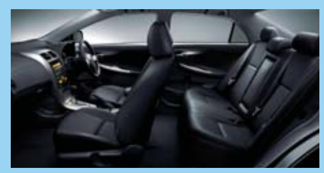
Ultima Sedan interior

Available in three models, from the well-appointed entry level Ascent up through the highly specified Conquest and the top grade luxury Ultima - there's a Corolla Sedan to suit every driver's taste. The Corolla Conquest and Ultima boast superior features and specifications, such as MP3 compatible CD player, seven SRS airbags and Bluetooth™^ technology which allows for hands-free mobile use, while the suitably-equipped entry level Ascent can be tailored with a number of generous option packs.