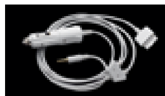
AUDIO CABLE AND CAR CHARGER FOR IPOD®