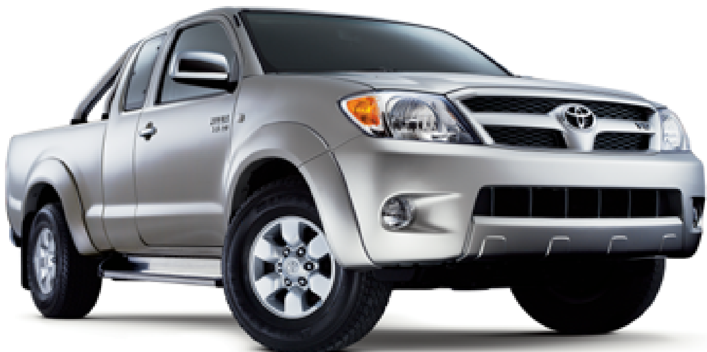
4x4 Xtra Cab SR5 model shown.