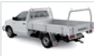
ALLOY TRAY BODY WITH OPTIONAL REAR RACK AND ALLOY WINDOW PROTECTOR FITTED

THESE ARE JUST SOME OF THE ACCESSORIES AVAILABLE FOR YOUR HILUX. FOR A COMPLETE LIST AND FURTHER DETAILS, PLEASE SEE YOUR TOYOTA DEALER OR REFER TO OUR WEBSITE.