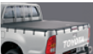
SOFT TONNEAU COVER