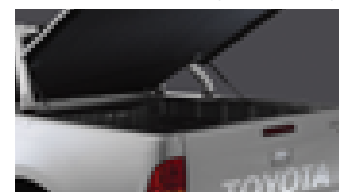
HARD TONNEAU COVER