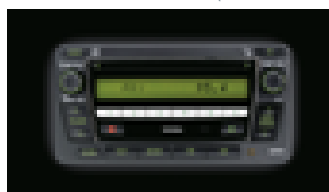
6 IN-DASH MP3 COMPATIBLE CD CHANGER AND RADIO WITH BLUETOOTH™†† HANDSFREE COMMUNICATIONS AND AUXILIARY AUDIO INPUT