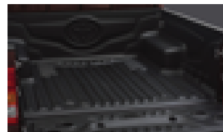
UTE LINER AND TAILGATE LINER