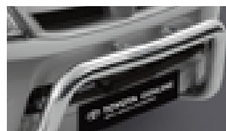
ALLOY NUDGE BAR – AIRBAG COMPATIBLE