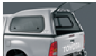
CANOPY (HIGH ROOF)