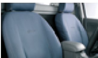
CANVAS SEAT COVERS