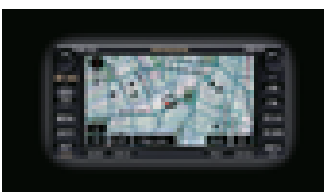
SATELLITE NAVIGATION AUDIO SYSTEM* – INCLUDES 4 IN-DASH MP3 CD CHANGER AND RADIO WITH BLUETOOTH™†† HANDSFREE COMMUNICATIONS