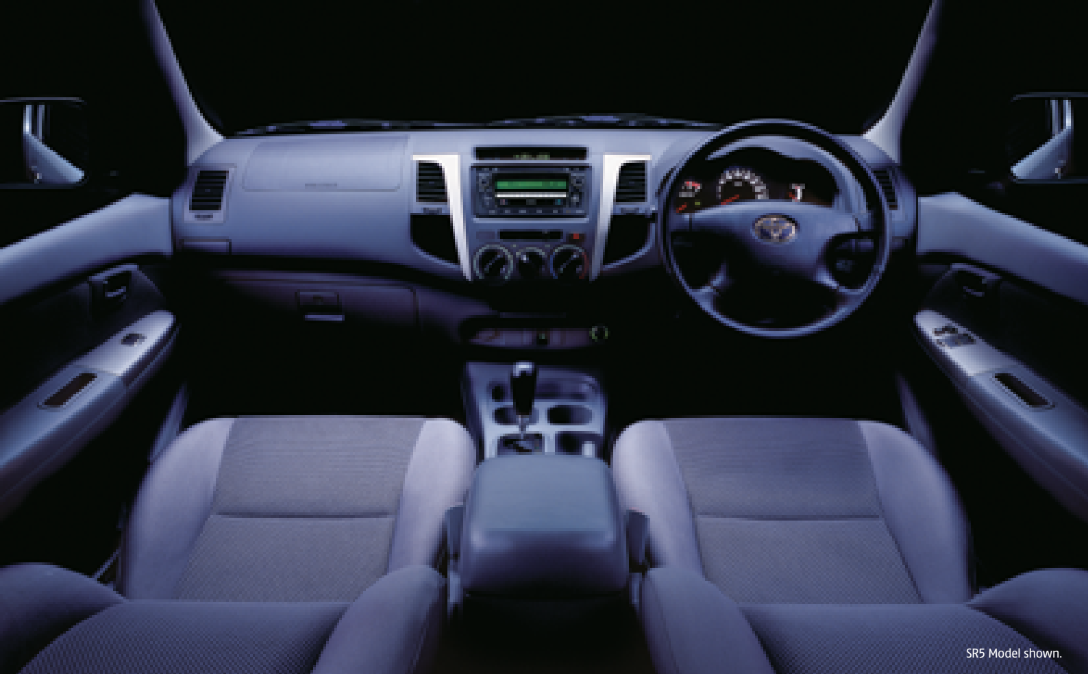
SR5 Model shown.