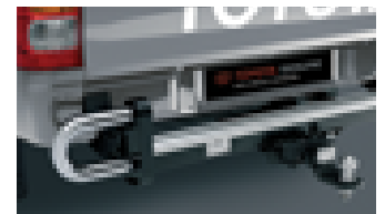
TOWBAR WITH REAR STEP (2250kg Braked)* TOWBALL AND TRAILER WIRING HARNESS (SOLD SEPARATELY)