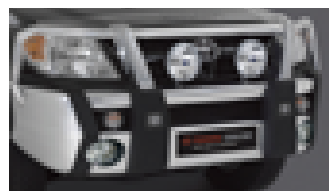
4X4 FORGE ALLOY BULL BAR – WITH OPTIONAL DRIVING LIGHTS (SOLD SEPARATELY)