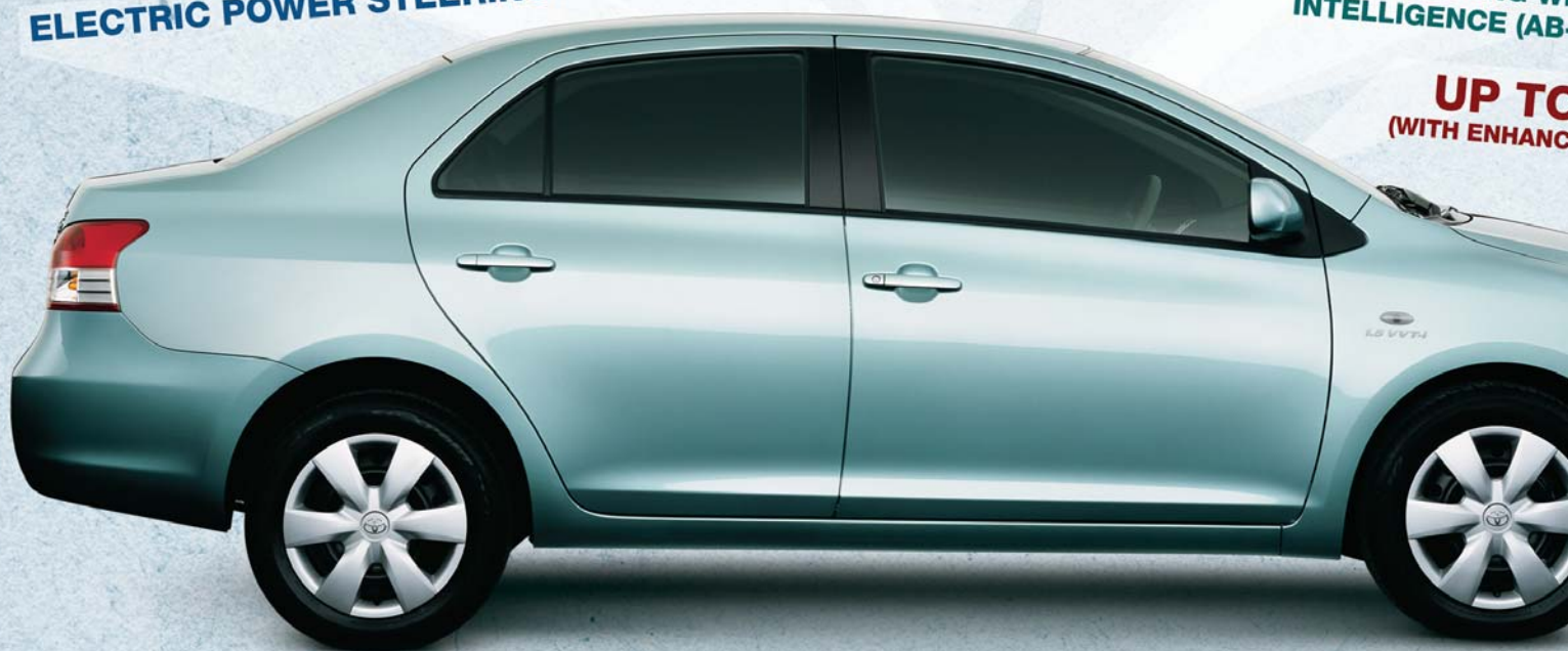
YRS model shown in Aqua Marine