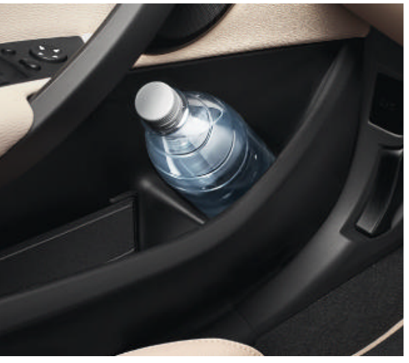
■ Bottle holders: safely accommodating bottles of various sizes and located in each of the front and rear doors.