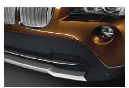
☐ X Line includes selected features with a valance in Aluminium satinated - front bumper, incl. fin in the air intake, rear bumper and side sills (only in conjunction with roof rails - aluminium satinated and standard on xDrive25i and xDrive23d).

☐ Interior and exterior mirrors with automatic anti-dazzle function. When a defined incidence of light is registered from following vehicles, the mirrors automatically adjust to the anti-dazzle position. Option includes electrical fold-in function and automatic parking function for exterior mirrors.