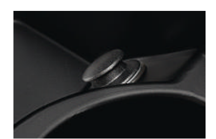
12V sockets (three) are located under the folding centre armrest, in the centre console trim in the rear and on the right of the luggage compartment.