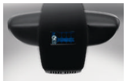
☐ Rain sensor, incl. automatic driving lights: Once activated, the rain sensor automatically turns on the windscreen wipers according to the intensity of the rain and independently controls the wiper interval. The integrated automatic driving lights automatically switch to low beam at dusk or when entering tunnels (Standard on sDrive20d, xDrive20d, xDrive23d and xDrive25i).