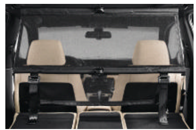
■ Luggage compartment partition net, can be fixed into the roof liner behind the first or second row of seats, providing protection from items falling into the passenger compartment and allowing the luggage compartment to be loaded safely up to the roof.