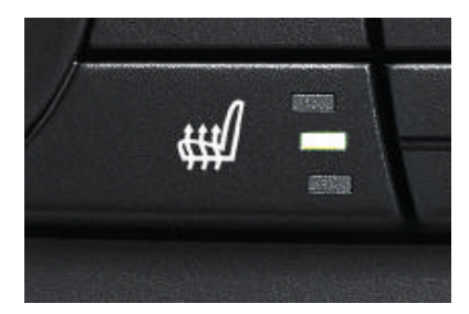
\hfill\square Seat heating (with three levels) for driver and front passenger. Seat surface and backrest, including side supports, can all be heated and deliver warmth shortly after you pull away.