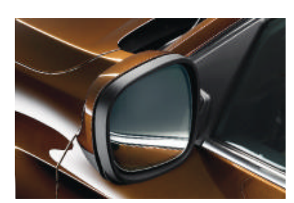
■ Exterior mirrors in body colour and electrically adjustable. The mirrors are also aspheric and can be heated.

☐ Interior and exterior mirrors with automatic anti-dazzle function. When a defined incidence of light is registered from following vehicles, the mirrors automatically adjust to the anti-dazzle position. Option includes electrical fold-in function and automatic parking function for exterior mirrors.