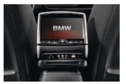
□ DVD system in the rear<sup>1,2</sup> includes a monitor with 7-inch colour display integrated into the centre armrest. The DVD system plays video DVDs and audio CDs (incl. MP3 format) and can also be used to display JPEG images. When the monitor is not in use it pivots 180 degrees and folds down. It also comes with an AV input. Infrared headphones available from Genuine BMW Accessories.