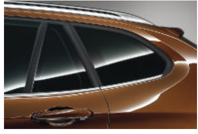
■ Chrome Line Exterior for the window cavity covers, the mirror triangle and the mirror frame in Black, high-gloss (only available for xDrive25i and xDrive23d).