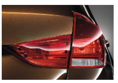
■ Dynamic Braking Lights help vehicles following behind to see how hard you are applying the brakes. During normal braking, the brake lights cover a large area. Only during emergency braking do the brake lights begin to flash. This allows following traffic to immediately distinguish between light braking and full braking - for even greater driving safety.