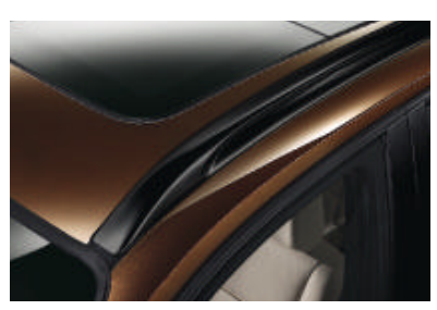
■ Roof rails, black: Harmoniously matched to the car's design, this system forms the basis of a multifunctional BMW roof support for effortless and safe transportation of luggage, bicycles, surfboards etc (Standard on sDrive18i, sDrive20d and xDrive20d).