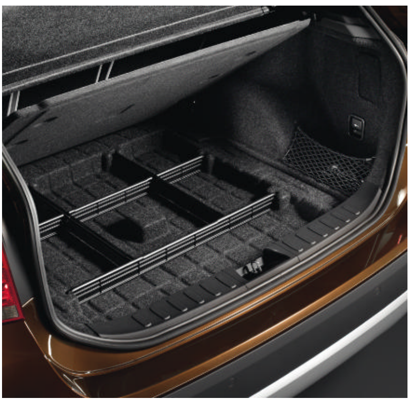
Stowage compartment under load compartment floor has four variable partition elements for flexible usage.

■ Storage package includes a host of intelligent and differently sized storage possibilities such as tensioning straps in the door pockets and storage nets on the front seat backrests.