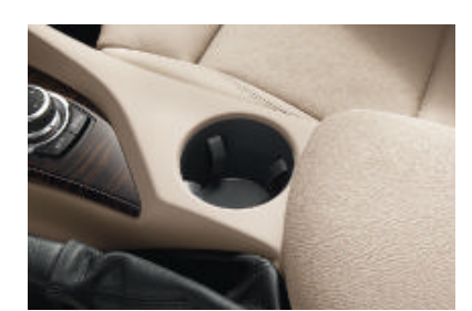
■ Cupholder, located in the centre console and within easy reach.