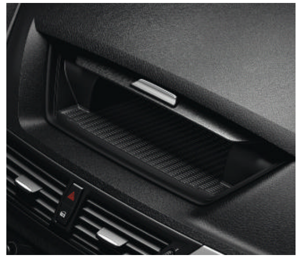
■ Storage compartment: A spacious compartment is located in the upper section of the dashboard (not in conjunction with a navigation system).

The new BMW X1 adjusts flexibly to your requirements. Whether you want to transport skis or snowboards, store larger items of luggage safely, or simply appreciate having such a large range of storage options available, the new BMW X1 will delight you again and again with its impressive versatility.