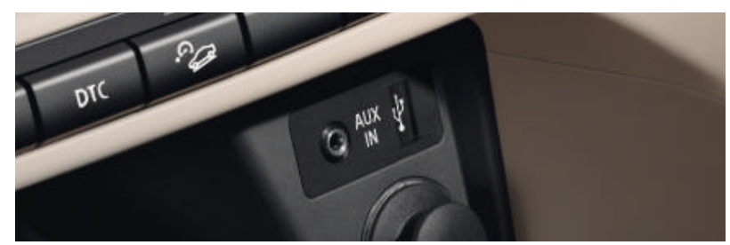
■ AUX-IN connection, incl. 12V socket for an external audio source such as an MP3 player. ■ USB audio interface for connection of a USB stick or MP3 player. Stored tracks are shown on the display of the Radio BMW Professional or on the Control Display included in a navigation system (optional). The system is operated using the buttons on the multifunction steering wheel, Radio BMW Professional or the iDrive Controller. The USB audio interface can be extended to include comfort connection for mobile music player.