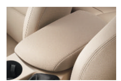
■ Front armrest, sliding, incl. a 12V socket.