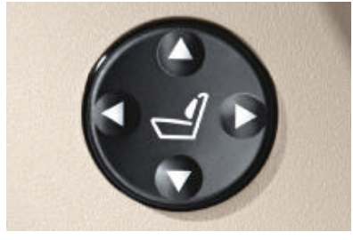
☐ Lumbar support for driver and front passenger, electrically adjustable in height and depth, for an ergonomically perfect seat position and support of the back muscles.