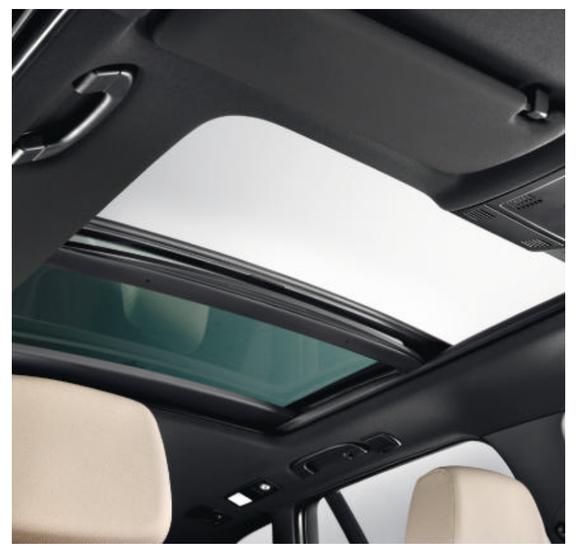
☐ Panorama glass roof with large opening and viewing area and wind deflector. The front half of the glass can be electrically raised by touch control and also has a sliding function, electric sliding roofliner (sun protection) as well as a comfort open/close function with trap release. ☐ BMW Individual roofliner Anthracite.