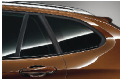
☐ BMW Individual High-gloss Shadow Line, includes the surrounds of the B-pillar, window guide, window cavity covers, mirror triangle and mirror frame in Black, high-gloss.