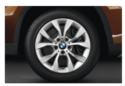
☐ BMW light-alloy wheels V-spoke 318, 7.5 J x 17-inch, 225/50 R 17 run-flat safety tyres (standard on xDrive25i and xDrive23d).