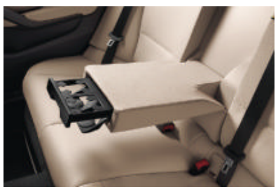
Two cupholders in the rear, integrated into the centre armrest.