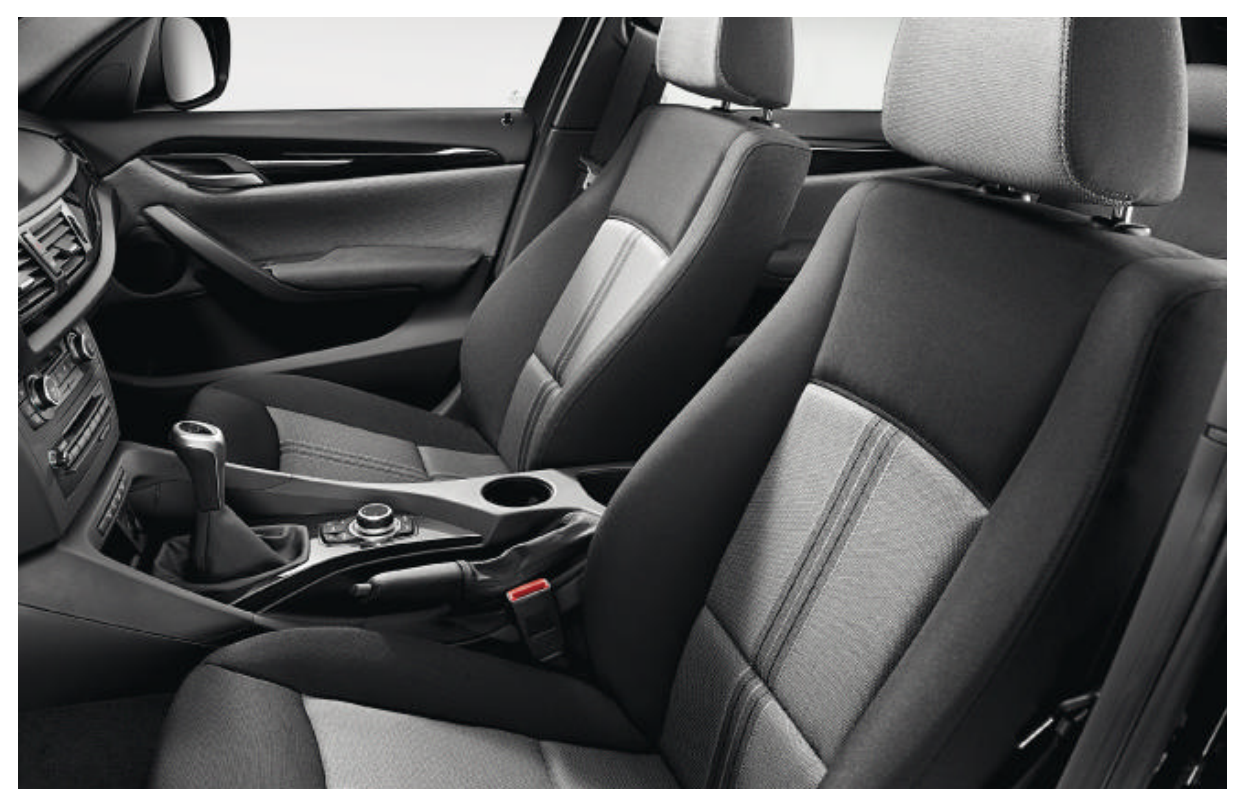
■ Standard seats (Median Cloth shown is not available in Australia), with manual adjustment of seat height, fore/aft position, backrest angle, height and angle of headrests.