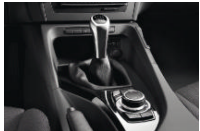
■ 6-speed manual transmission allows a very sporty driving style. It is extremely smooth, with perfect ratios and precise, shortthrow gearshifts. The closely spaced gear ratios and the addition of a sixth gear enable the driver to make even more individual use of the engine's characteristics (not available on xDrive25i and xDrive23d).