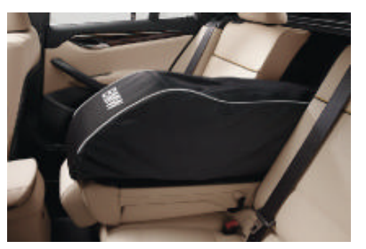
☐ Ski and snowboard bag* allows up to four pairs of skis or two snowboards to be transported cleanly and safely when up to four people are inside the car. The skibag is easy to detach and can also be used outside the car. When not required, it can be stored - without taking up much space - in the bag supplied.