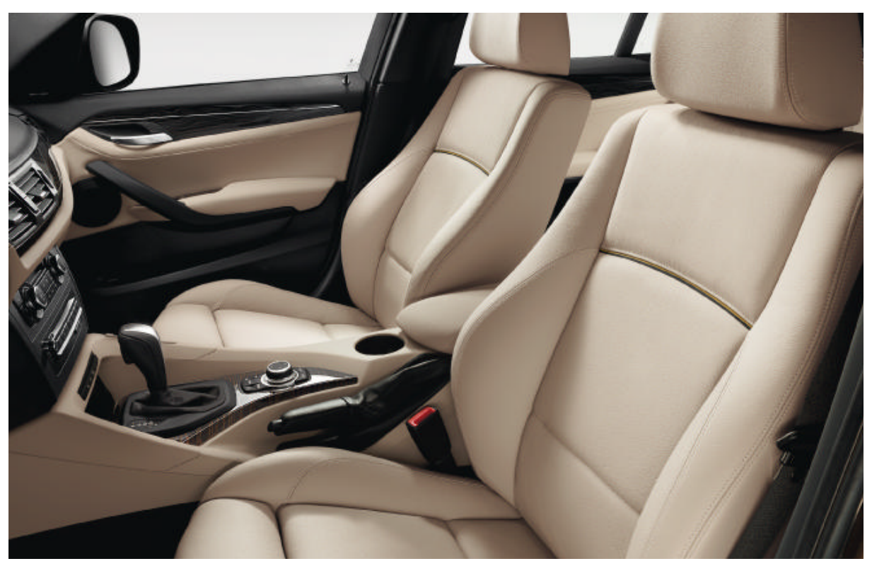
□ Sport seats for driver and front passenger, with higher side bolsters and infinitely variable electric backrest width adjustment for optimum lateral support. Manual adjustment of fore-and-aft position, seat height, backrest angle, seat angle and thigh support.