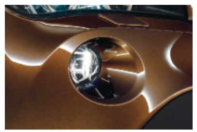
■ Fog lights integrated in the front apron for improved safety in poor visibility, including heated exterior mirrors and windscreen washer nozzles.