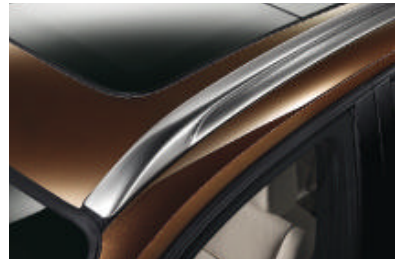
☐ Roof rails, Aluminium satinated: For an individual look, the roof rails are also available in Aluminium satinated (only in conjunction with X Line, standard on xDrive25i and xDrive23d).