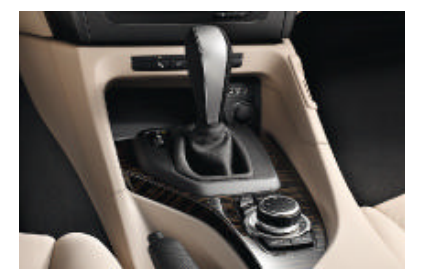
☐ 6-speed automatic transmission Steptronic with Adaptive Transmission Management (ATM). The transmission allows for very fast, precise gearshifts and maximum dynamic performance (Standard on xDrive25i and xDrive23d including gearshift paddles for the leather steering wheel).