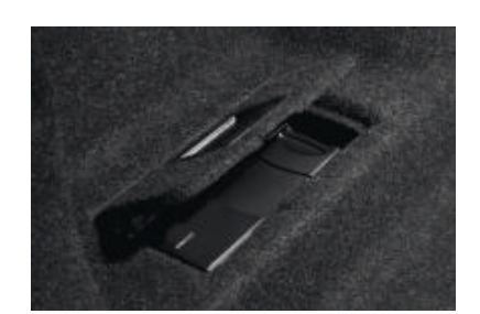
☐ CD changer for six CDs