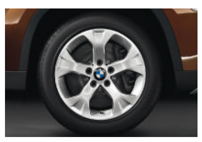
■ BMW light-alloy wheels star-spoke 317, 7.5 J x 17-inch, 225/50 R 17 run-flat safety tyres (standard on sDrive18i, sDrive20d and xDrive20d).