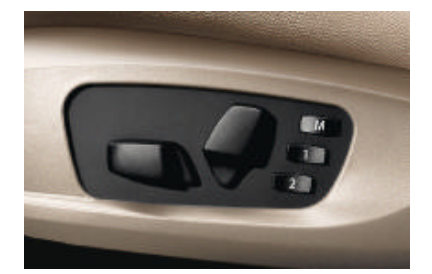
\square Seat adjustment for driver and front passenger with electric seat height and backrest adjustment, as well as fore/aft and seat angle adjustment, with memory function for driver's seat and exterior mirrors (including automatic parking function). Two personalised positions can be stored for the settings of the driver's seat and the exterior mirrors.