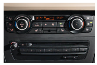
■ Automatic air conditioning, with Automatic Air Recirculation (AAR), microfilter, fogging and solar sensors and residual heat button, quickly creates the desired climate and maintains the selected temperature. Separate temperature control for left and right sides.