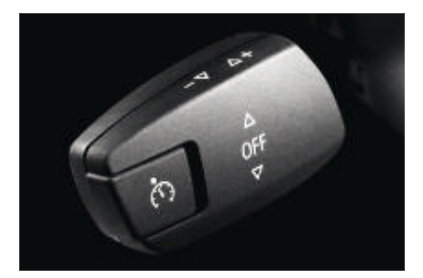
■ Cruise control with braking function stores and maintains the desired speed, from approx. 30 km/h, (controlled by the left-hand steering column stalk).