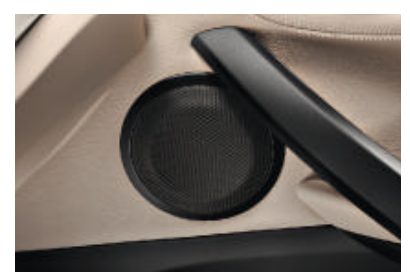
☐ harman/kardon surround sound system with powerful amplifier output, equalizer, centre speaker and eleven high-performance loudspeakers creates outstanding sound quality. Plus, a surround function allows various sound environments to be simulated.

☐ HiFi loudspeaker system with eight loudspeakers for brilliant sound.