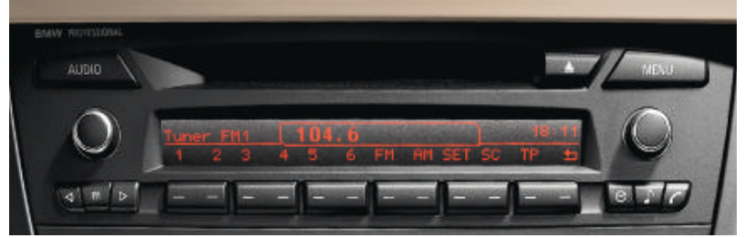
■ Radio BMW Professional, with two-line display to show detailed information on telephone numbers, names or on-board computer functions.

☐ HiFi loudspeaker system with eight loudspeakers for brilliant sound.