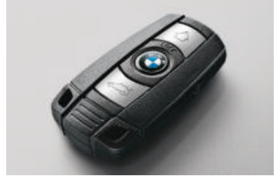
■ Personal Profile: This stores your personal preferences depending on equipment for settings such as the temperature and air distribution of the automatic air conditioning, the position of the driver's seat and exterior mirrors, and the volume and sound of the radio. Settings are then activated when you unlock the central locking.