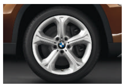
\square BMW light-alloy wheels star-spoke 320, 8 J x 18-inch, 225/45 R 18 run-flat safety tyres.