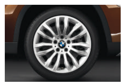
\square BMW light-alloy wheels double-spoke 321, 8 J x 18-inch, with 225/45 R 18 run-flat safety tyres.