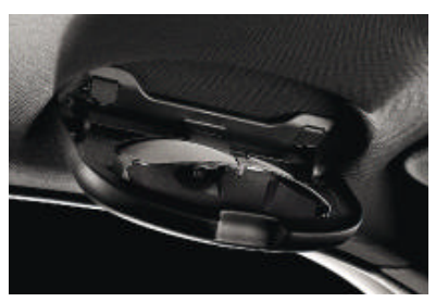
Glasses compartment in the roof liner allows you to reach your glasses or store them safely away in a single movement.