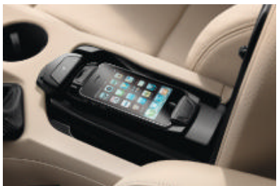
■ Preparation for mobile phone with Bluetooth interface (with hands-free system, connection for recharging and external aerial). A separately available snap-in adapter enables connection of a Bluetooth-compatible mobile phone, which can also be operated via iDrive (in conjunction with navigation system).