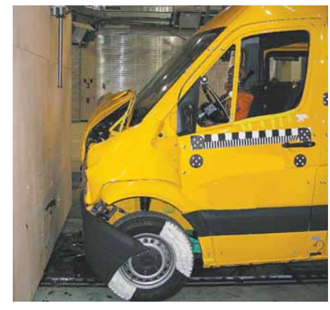
Sprinter crash test

Every Mercedes-Benz Sprinter is fitted with a driver's airbag as standard with the option of including a passenger airbag, side window airbags and thorax airbags.