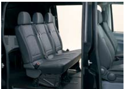
Second row of removable seats