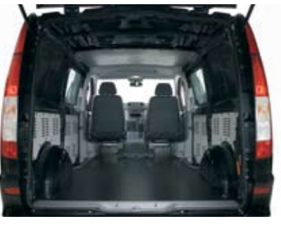
Easy pallet access from the back of the vehicle