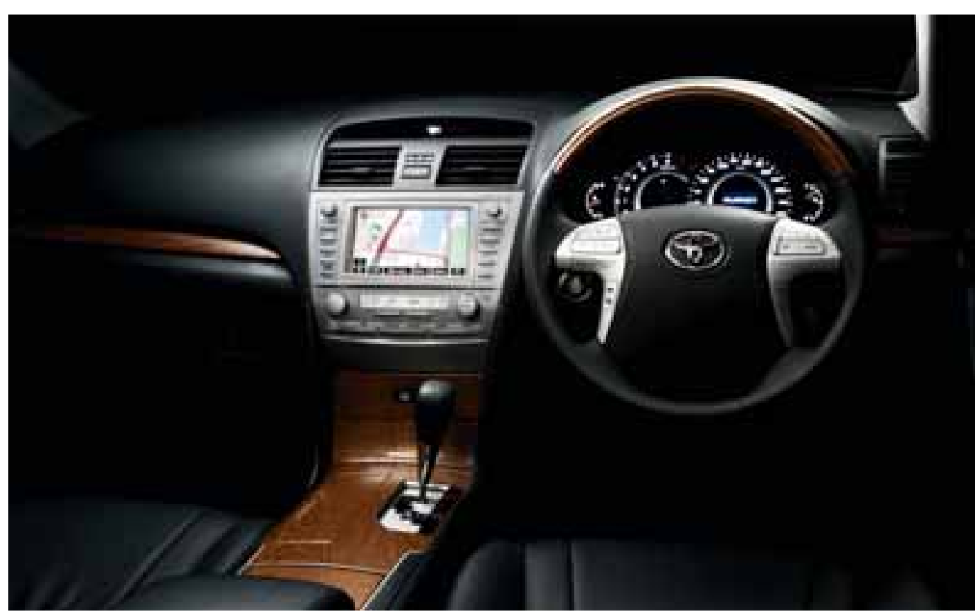
Presara model shown.