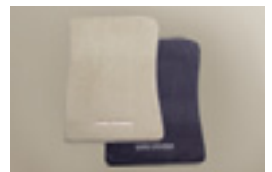
CARPET FLOOR MAT SET - OAK OR GREY (FRONT & SECOND ROW SET)