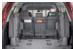
CARGO BARRIER - CURTAIN SIDE AIRBAG COMPATIBLE