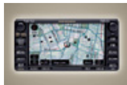
SATELLITE NAVIGATION ^ AUDIO SYSTEM WITH BLUETOOTH †† COMMUNICATIONS & (OPTIONAL) AUXILIARY AUDIO INPUT (sold separately) Available on GXL & VX.