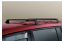
AERO ROOF RACK - 2 bar set