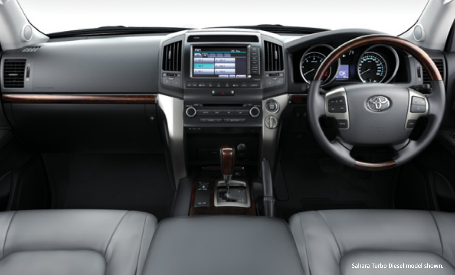
Sahara Turbo Diesel model shown.