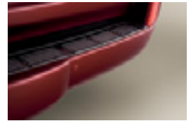
PARKASSIST † - REVERSE PARKING SENSORS (4 HEAD KIT)