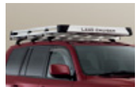
ALLOY ROOF TRAY - Requires Heavy Duty Roof Rack - 3 bar set (sold separately)