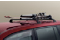
DELUXE SKI & SNOWBOARD CARRIERS (4 OR 6) Requires Aero Roof Rack - 2 bar set (sold separately)