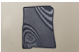
ALL WEATHER RUBBER FLOOR MATS (FRONT PAIR & SECOND ROW) (sold separately)