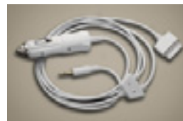
AUDIO CABLE & CAR CHARGER FOR IPOD ®†† Available for all vehicles with Auxiliary input.