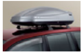
ATLANTIS ROOF POD IN 200 OR 600 (200 SHOWN) Requires Aero Roof Rack - 2 bar set (sold separately)