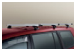
HEAVY DUTY ROOF RACK - 3 bar set