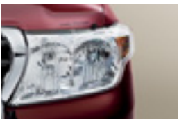
BONNET PROTECTOR & HEADLAMP COVERS (sold separately)