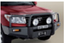
STEEL WINCH BAR WITH SUPERWINCH & RALLYE FF 4000 DRIVING LIGHTS BLACK (sold separately)

Whether you're after an even more rugged look, extra storage options or greater convenience, your LandCruiser 200 deserves accessories with a proven pedigree. Combining innovative style with the strength and durability you expect from Toyota, these additions have been purpose-built for your LandCruiser – and your lifestyle. Integrating seamlessly with the original specifications, they not only look like they were meant to be there, they perform like it too. So whether you're working hard or playing harder, make sure you start on the right track with Toyota Genuine Accessories.