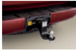
TOWING KIT (ON ROAD) 3500KG (BRAKED CAPACITY)* WITH TRAILER WIRING HARNESS (sold separately)