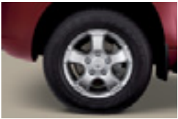
18" x 8" ALLOY WHEELS