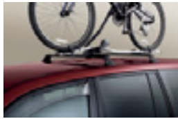
PRO RIDE BICYCLE CARRIER Requires Aero Roof Rack - 2 bar set (sold separately)