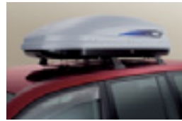
PACIFIC 200 ROOF POD Requires Aero Roof Rack - 2 bar set (sold separately)