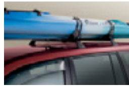
KAYAK CARRIER Requires Aero Roof Rack - 2 bar set (sold separately)