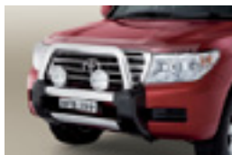
ALLOY NUDGE BAR & RALLYE FF 4000 DRIVING LIGHTS CHROME (sold separately)