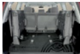
ALL WEATHER RUBBER CARGO MAT