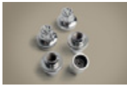
ALLOY WHEEL LOCK NUT SET