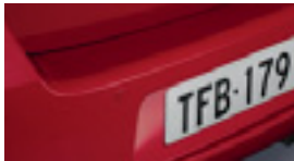
ParkAssist ® – Reverse Parking Sensor