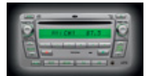
6 In-dash MP3 Compatible CD Changer & Radio with Bluetooth™ ^ Handsfree Communications & Auxiliary Audio Input YR/YRS 3 & 5 Door Hatch