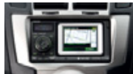
FollowMe Sound & Navigation System* – incl single In-dash MP3 compatible CD Changer with Bluetooth™ ^ Handsfree Communications, USB IN & (optional) iPod ® Control †