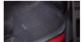
Carpet Floor Mats