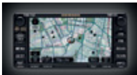
Satellite Navigation Audio System* – incl 4 In-dash MP3 compatible CD Changer with Bluetooth™ ^ Communications & (optional) Auxiliary Audio Input