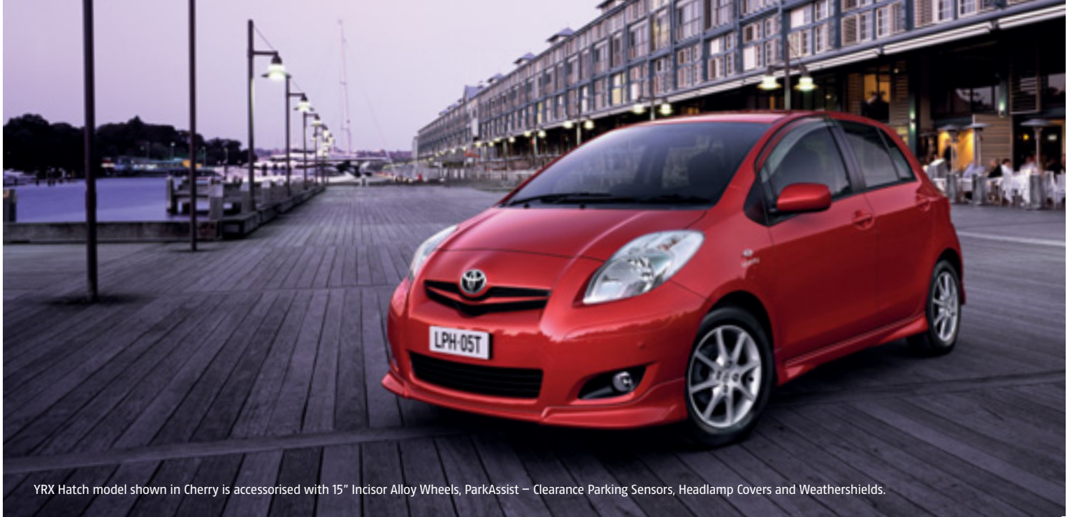
YRX Hatch model shown in Cherry is accessorised with 15" Incisor Alloy Wheels, ParkAssist – Clearance Parking Sensors, Headlamp Covers and Weathershields.