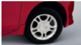
14" Entice Alloy Wheels YR model only