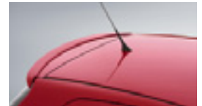
Rear Roof Spoiler YR & YRS models only