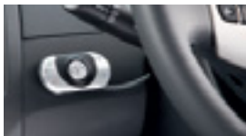
Bluetooth™ ^ HandsFree Kit