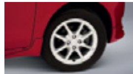
15" Incisor Alloy Wheels