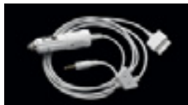
Audio Cable & Car Charger for iPod ® *