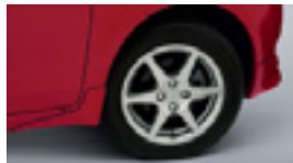
15" Talon Alloy Wheels (Tungsten)