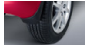
Mudguard YR & YRS models only