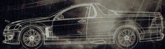
Maloo R8 5121mm