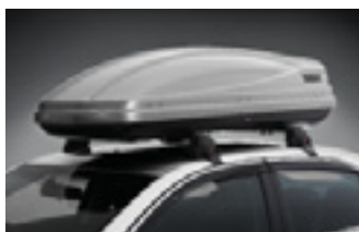
ATLANTIS 200 OR 600 ROOF POD (sold separately) Atlantis 200 shown