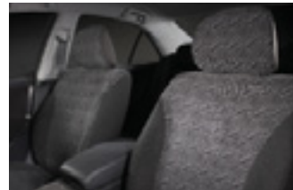
SEAT COVERS - Front & Rear Set (sold separately) Available for AT-X