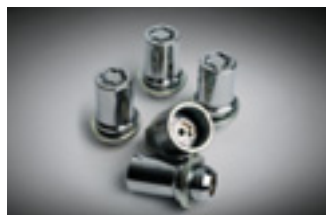
ALLOY WHEEL LOCK NUTS