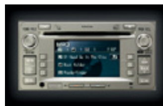
DISPLAY AUDIO SYSTEM - Includes 6 in-dash MP3/CD Changer & Radio with Bluetooth TM(4) featuring Handsfree capabilities & Audio Streaming, and is compatible with (optional) Rear View Camera (8) and some iPods (5) , MP3 and USB sticks (6) . Available for AT-X