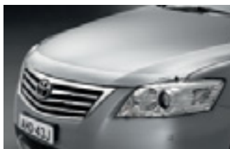
BONNET PROTECTOR & HEADLAMP COVERS (sold separately)