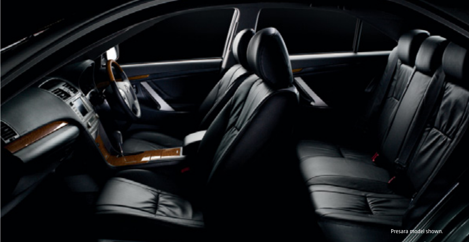
Presara model shown.

Aurion V6 combines exhilarating performance, with dynamic handling and control to deliver a car you'll love to drive. Smarter thinking, more intelligent engineering and refined styling. It's the non-traditional big Aussie 6.