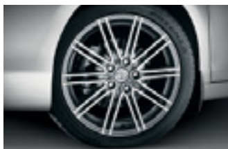
18" x 75" KAPPA ALLOY WHEELS

You've made a call. And now it's time to make your Aurion yours with Toyota Genuine Accessories. Designed and detailed to fit seamlessly with your vehicle, it's your chance to stand even further apart from the crowd.