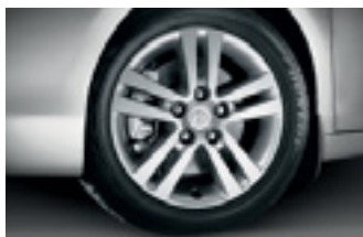
16" x 7" RAPTOR ALLOY WHEELS - Machined & Painted Finish Painted finish shown Available for AT-X & Prodigy