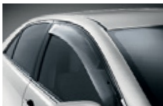
WEATHERSHIELDS - Slimline & Front (sold separately) Front shown