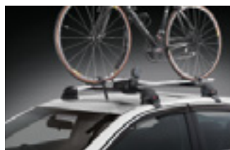
PRO RIDE BICYCLE CARRIER