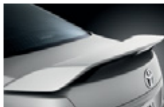
REAR SPOILER Available for AT-X, Prodigy & Presara