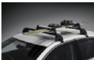
DELUXE SKI & SNOWBOARD CARRIER - 4 OR 6