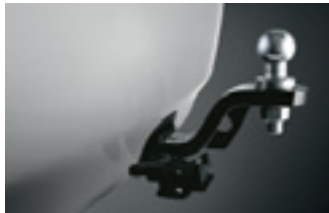
TOWBAR (1600KG BRAKED CAPACITY) , TOWBALL & TRAILER WIRING HARNESS (sold separately)