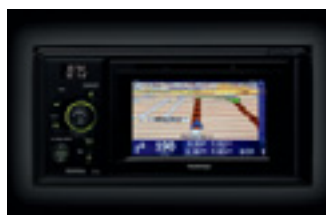
FOLLOWME ® SOUND & NAVIGATION SYSTEM (3) - Includes Bluetooth TM(4) Handsfree capabilities, Video and is compatible with (optional) Rear View Camera (8) and some iPods (5) , MP3 and USB sticks (6) . Available for AT-X, Prodigy, Sportivo SX6 & ZR6