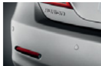
PARKASSIST TM - Clearance Parking Sensors & Reverse Parking Sensors (sold separately) Reverse Parking Sensors shown Available for AT-X & Sportivo SX6