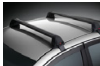
AERO ROOF RACKS - 2 Bar Set