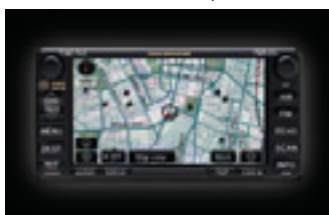
SATELLITE NAVIGATION AUDIO SYSTEM (7) - Includes 4 in-dash MP3 CD Changer & Radio with Bluetooth TM(4) Handsfree capabilities and (optional) Rear View Camera (8) compatibility. Available for AT-X, Prodigy, Sportivo SX6 & ZR6