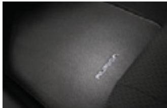
'AURION' CARPET FLOOR MATS - Front & Rear Set Black (shown) - Available for AT-X, Prodigy & Presara Sandstone - Available for Prodigy & Presara 'SPORTIVO' Black - Available for Sportivo SX6 & ZR6