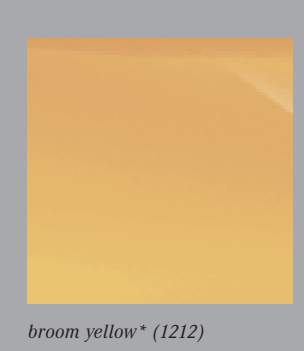
The colours depicted here are as close as the printing process allows us. Please contact your authorised dealer for colour samples. Standard van colour is arctic white. *Metallic and non-metallic colour paint finishes available as options at extra cost.