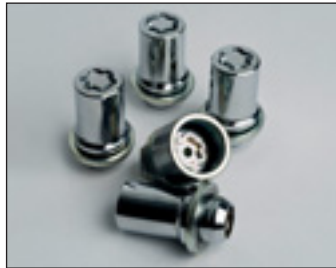
Alloy Wheel Lock Nut Set Available for Conquest, Levin SX, Levin ZR & all accessory wheels