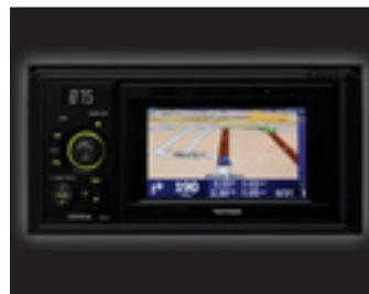
FollowMe ® Sound & Navigation System † Includes Bluetooth™ ‡ Handsfree capabilities and is compatible with Video and some iPods ® *, MP3 and USB sticks. †