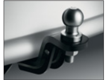
Towbar* 1300kg (braked capacity), Towball & Trailer Wiring Harness Sold separately