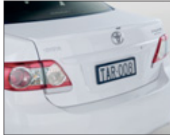
Rear Spoiler Available for Ascent Sedan only