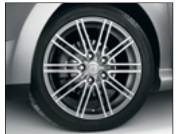
17" x 7" Kappa Alloy Wheel