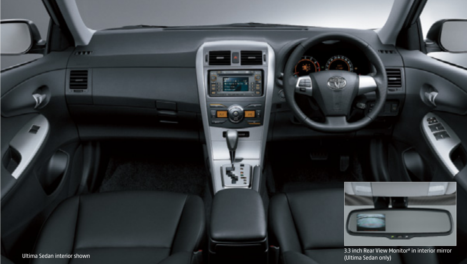
Ultima Sedan interior shown