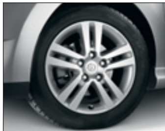
16" x 7" Raptor Alloy Wheel Painted Finish