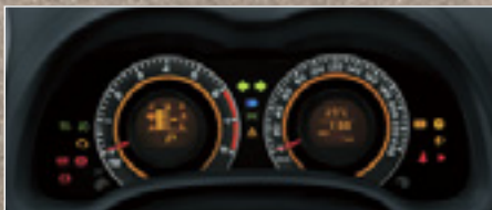
2-dial type Optitron display. Standard on Conquest and Ultima models