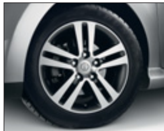
16" x 7" Raptor Alloy Wheel Machined Finish