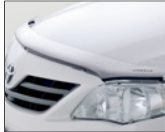
Bonnet Protector & Headlamp Covers Sold separately