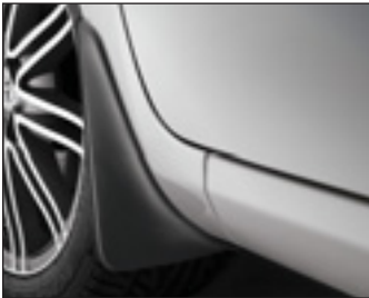
Mud Guard Set of 4 Available for Ascent & Conquest only