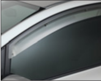
Front Weathershields Sold separately