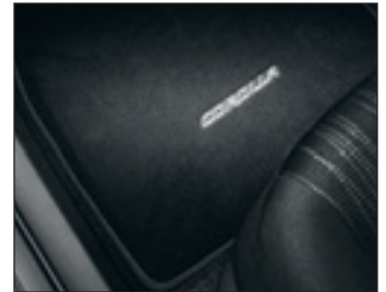
Carpet Floor Mats Grey Front and rear set