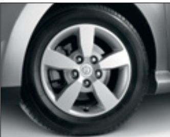
15" x 6.5" Atlas Alloy Wheel Available for Ascent only