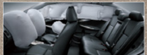
Driver and front passenger SRS airbags, front seat side airbags, full length side curtain shield airbags ^ and driver's knee airbag ^