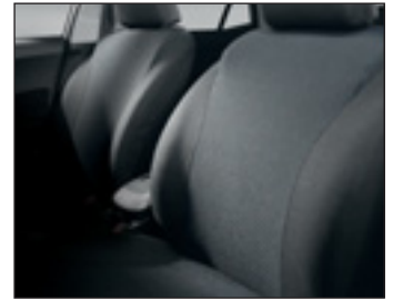
Seat Covers Dark Grey Front & rear set sold separately