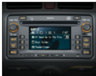
Display Audio System Includes 6 in-dash MP3/CD Changer & Radio with Bluetooth™ ‡ featuring Handsfree capabilities & Audio Streaming, and is compatible with Video and some iPods ® *, MP3 and USB sticks. †