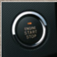
Smart Start button. Standard on Ultima model