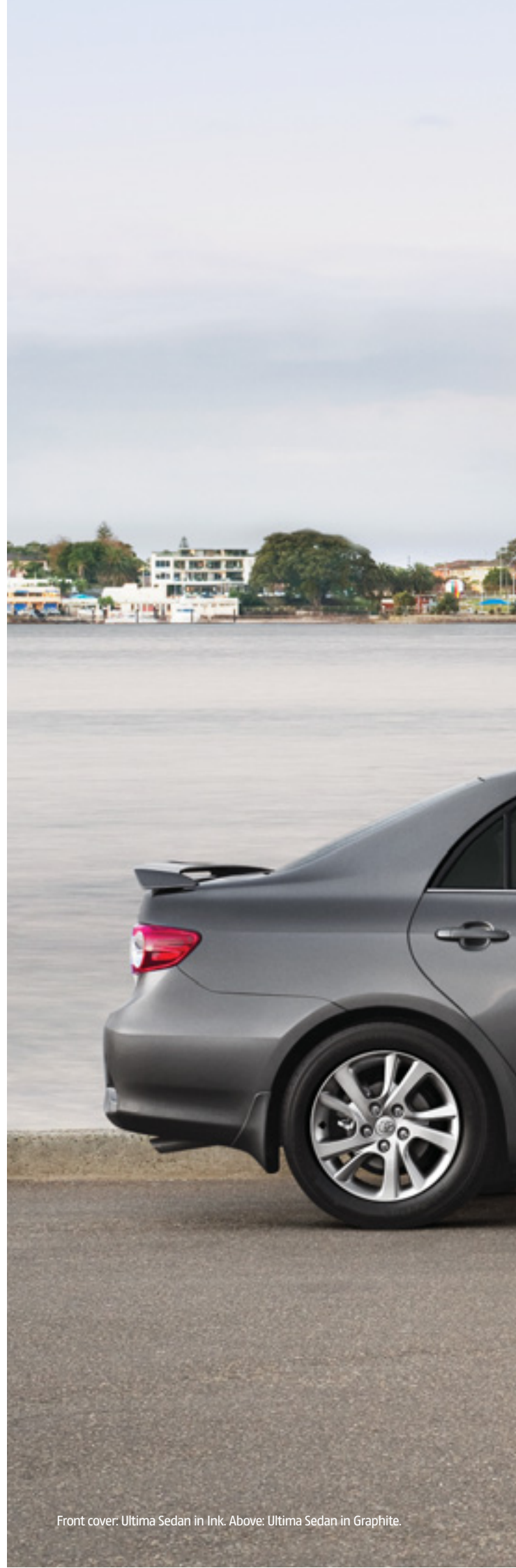
Front cover: Ultima Sedan in Ink. Above: Ultima Sedan in Graphite.

^ Available as standard on Ascent models from September 2010 production.