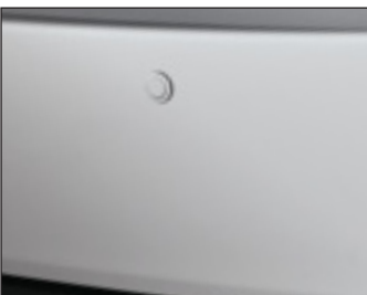
Park Assist † Reverse Parking Sensors (4 head kit) and Front Corner Clearance Parking Sensors (2 head kit) Sold separately