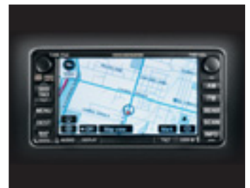
Satellite Navigation Audio System † Includes 4 in-dash MP3/CD Changer & Radio with Bluetooth™ ‡ Handsfree Communications.