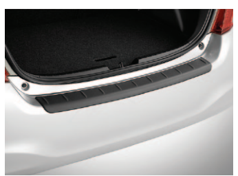
REAR BUMPER PROTECTION PLATE