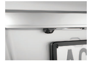
REVERSING CAMERA<sup>1</sup> AVN or Display Audio Unit required