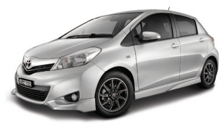
YRX hatch in Silver Pearl shown accessorised with genuine after-sale dealer fitted body kit and 15" alloy wheels.

The Genuine Accessories for your new Yaris are as clever as it is. Being designed by Toyota for your Toyota, they complement your car beautifully. From body kits to alloy wheels, they integrate seamlessly and enhance your ownership experience.