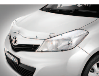
HEADLAMP COVER AND BONNET PROTECTOR (Sold separately)