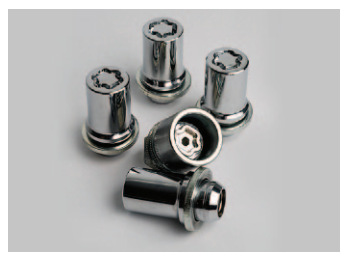
ALLOY WHEEL LOCK NUTS