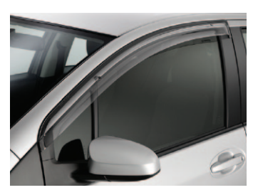
WEATHERSHIELD (Sold separately)