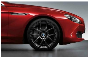
20" Alloy wheels V-Spoke 356

For more information, please contact your preferred BMW Dealer who will be pleased to advise you on the full range of Genuine BMW Accessories, or visit bmw.com.au/accessories .