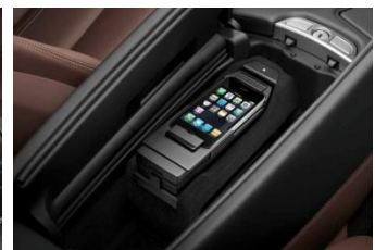
Media Snap-in-adaptor, iPhone 4G