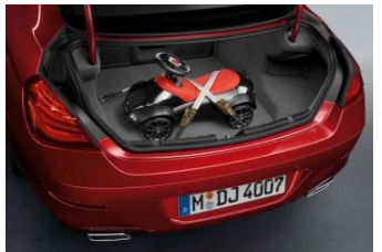
Luggage compartment tension belt

This insurance is provided by Allianz Australia Insurance Limited AFSL 234708 ABN 15 000 122 850. Please visit bmwfinance.com.au and read a Products Disclosure statement to decide if these products are right for you.