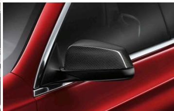
Exterior mirror caps, carbon