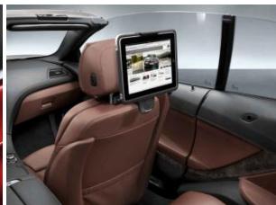
Travel & Comfort System, Carrier for Apple iPad