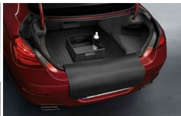
Fitted luggage compartment mat with collapsible box