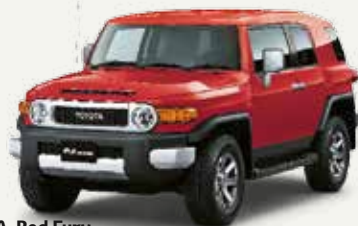
A. Red Fury