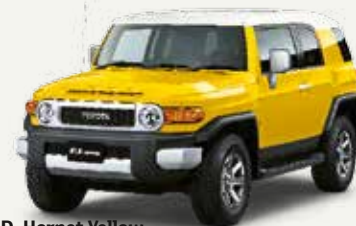
D. Hornet Yellow