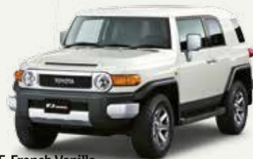
F. French Vanilla