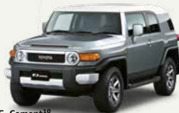
G. Cement 10