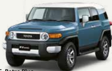
E. Retro Blue