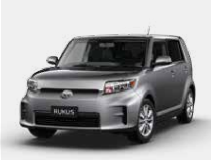
Silver Pearl<sup>4</sup> 1F7