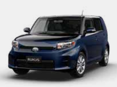
Dynamic Blue<sup>4</sup> 8S6