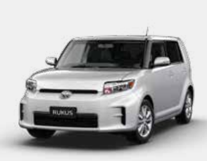
Glacier White 040