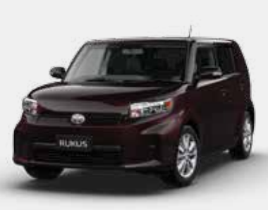
Dark Furnace<sup>4</sup> 3R0