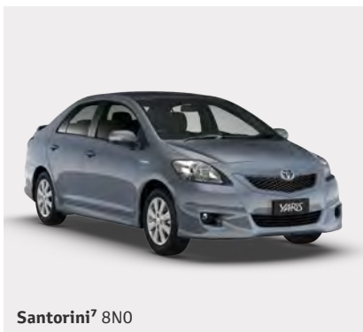
Santorini 7 8N0