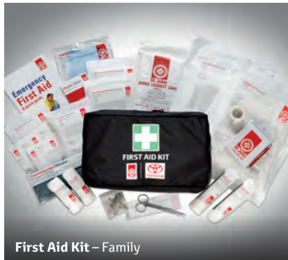
First Aid Kit – Family

You can personalise your Yaris with Toyota Genuine Accessories 8 (each sold separately). Whether it's to enhance looks or functionality, they're all developed to strict standards and backed by our Toyota Warranty.