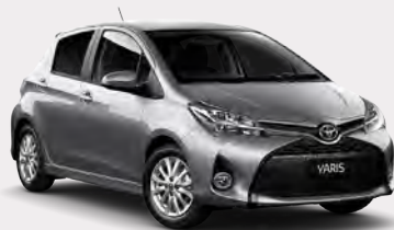
Silver Pearl 7 1F7