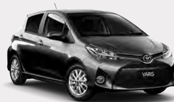
Graphite 7 1G3