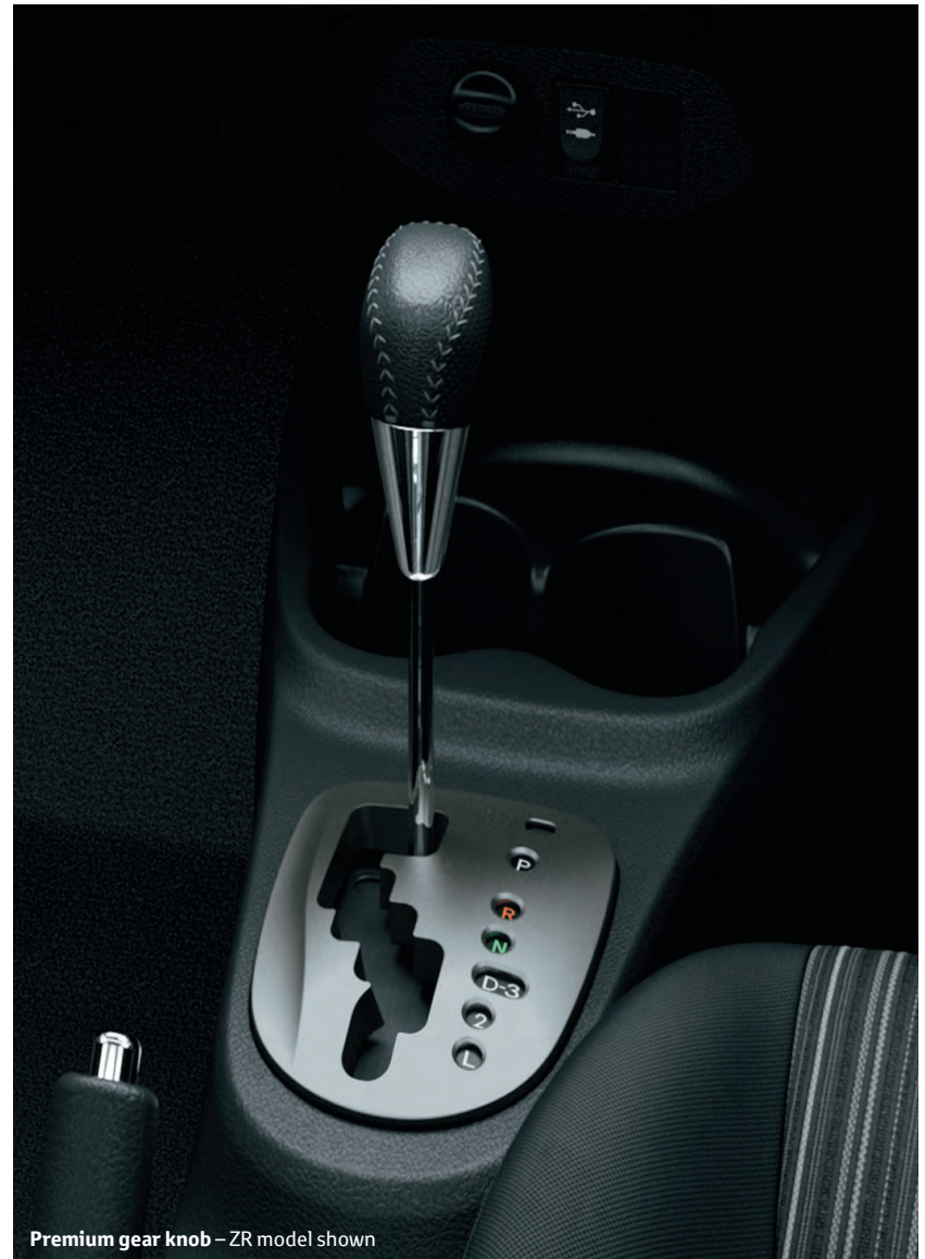
Premium gear knob – ZR model shown

Yaris is available as a 4-speed automatic across the range or choose the 5-speed manual in the Ascent and SX Hatch or YRS Sedan. Allowing you to enjoy a smooth ride wherever you're heading.