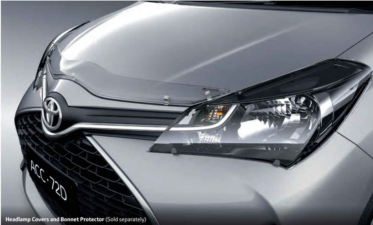
Headlamp Covers and Bonnet Protector (Sold separately)