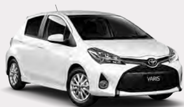
Glacier White 040

Yaris Hatch is available in nine fun-loving colour variations, suited to any personality and style. So whatever your plans, or wherever you need to go, there's sure to be a Yaris that's perfect for you.