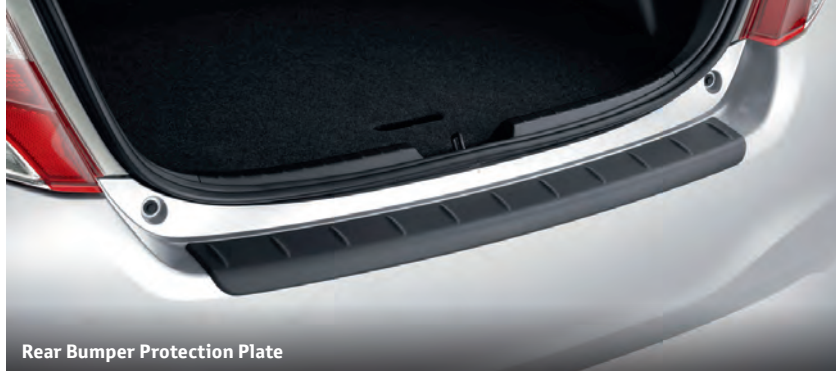
Rear Bumper Protection Plate