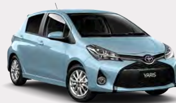
Aura 7 8V7