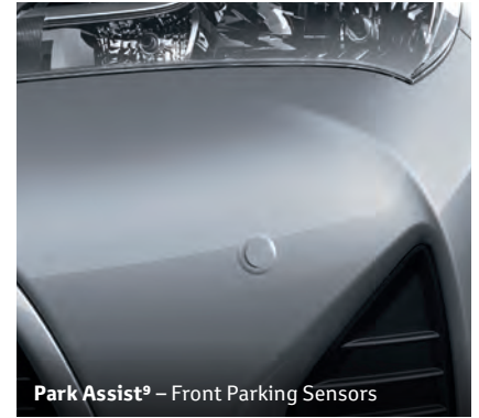
Park Assist ® – Front Parking Sensors