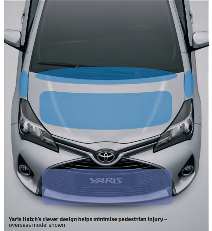
Yaris Hatch's clever design helps minimise pedestrian injury – overseas model shown

Choose from the Yaris Hatch range and you'll be equipped with seven SRS airbags and an emergency brake signal, which automatically activates and flashes the car's hazard warning lamps. This helps draw the attention of drivers behind you to assist in reducing the likelihood of a collision. All grades of Yaris Hatch have also been awarded the highest 5-star ANCAP safety rating.