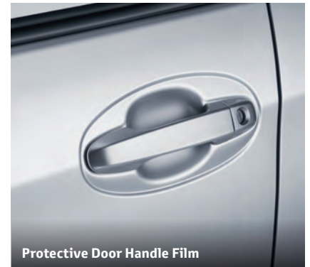
Protective Door Handle Film