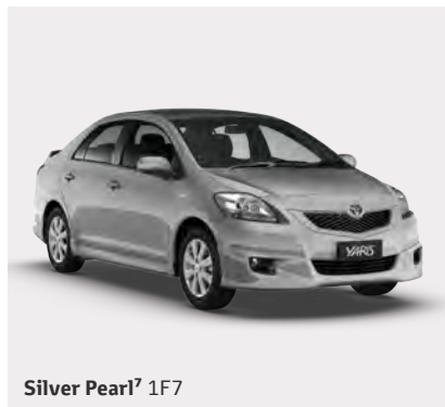
Silver Pearl 7 1F7