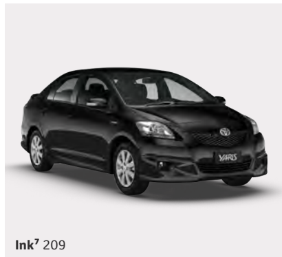
Ink 7 209