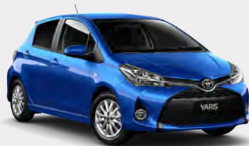
Tidal Blue 7 8T7