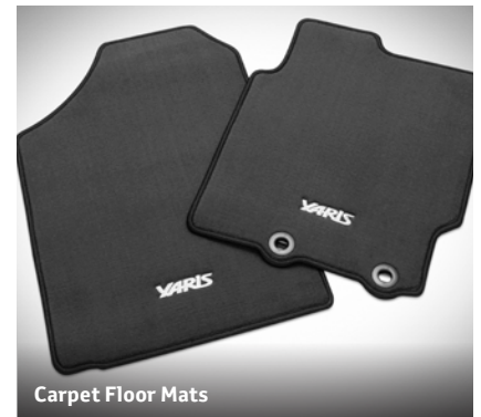
Carpet Floor Mats