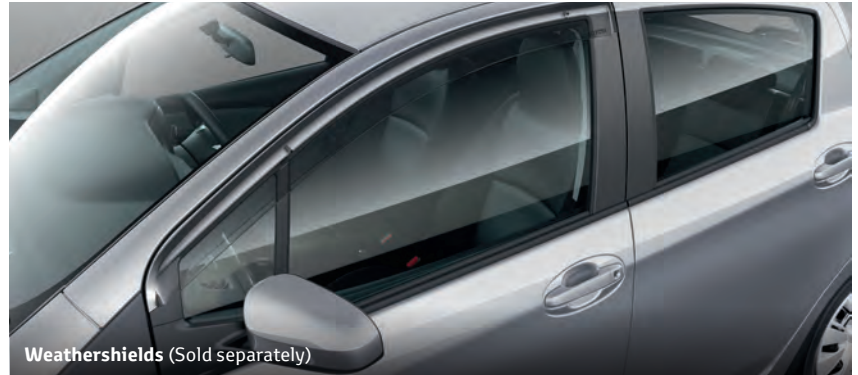
Weathershields (Sold separately)