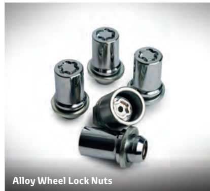
Alloy Wheel Lock Nuts