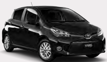
Ink 7 209