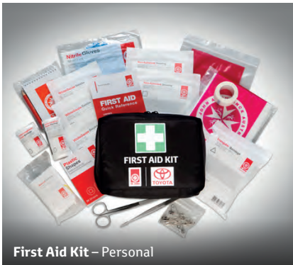
First Aid Kit – Personal