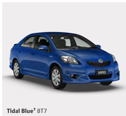
Tidal Blue 7 8T7