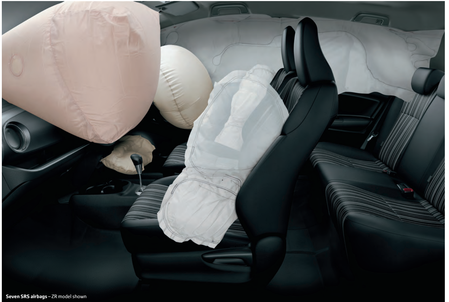
Seven SRS airbags – ZR model shown