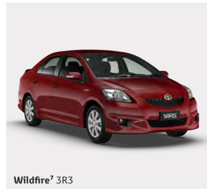
Wildfire 7 3R3