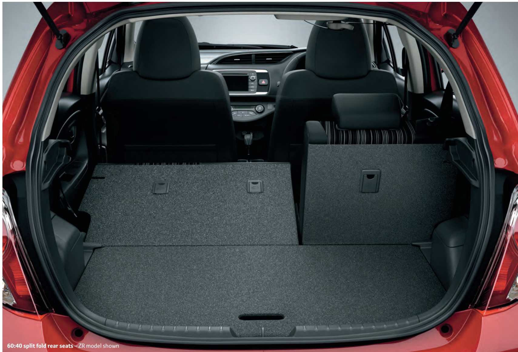
60:40 split fold rear seats – ZR model shown