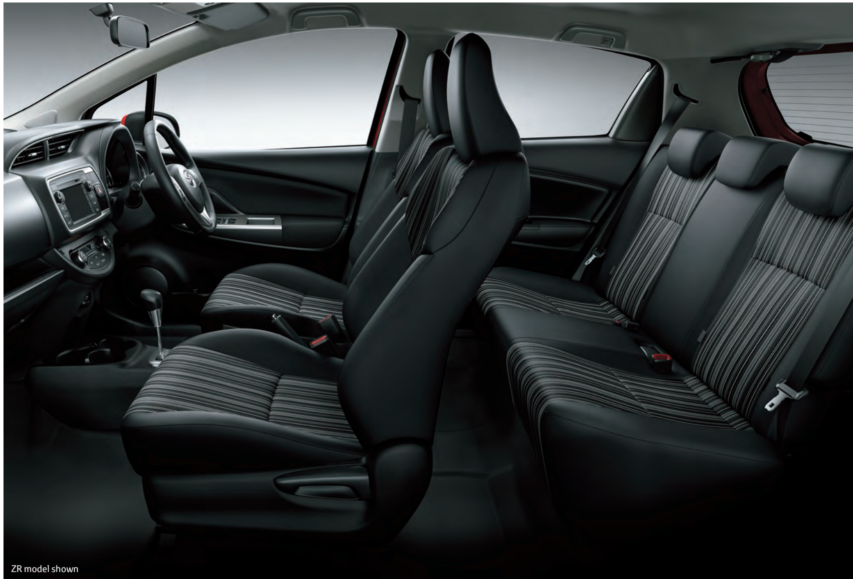
ZR model shown