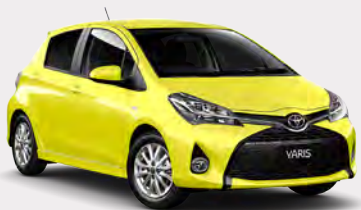
Vivid Yellow 5B5