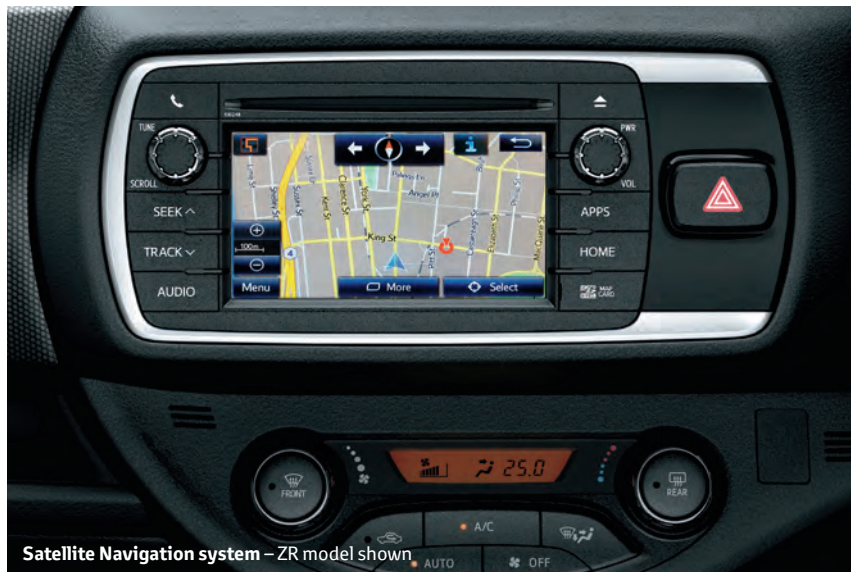
Satellite Navigation system – ZR model shown