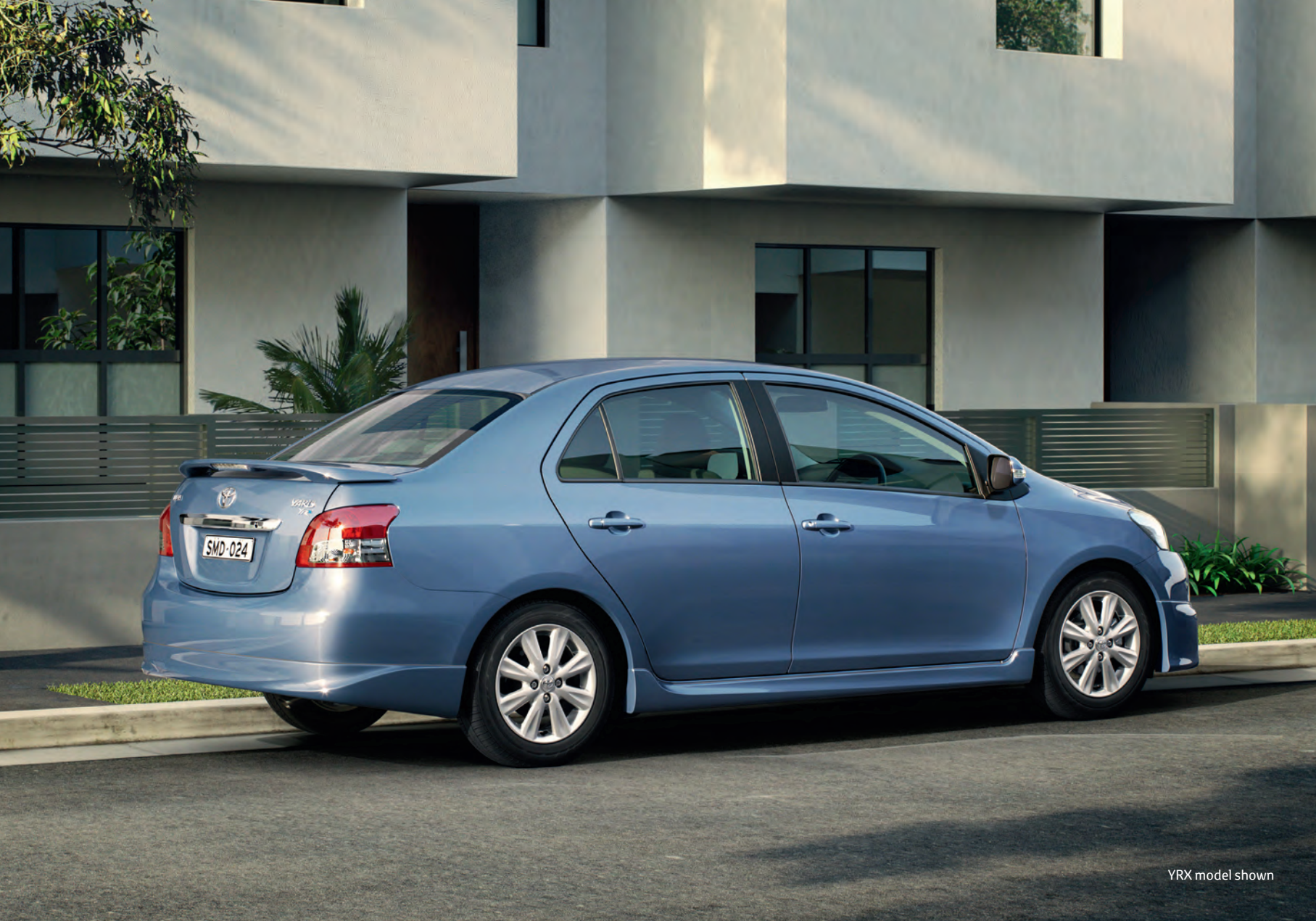
YRX model shown