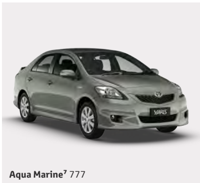
Aqua Marine 7 777