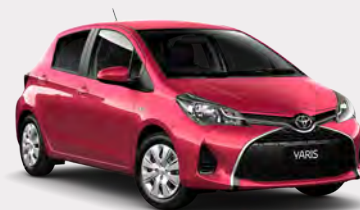
Cosmopolitan 7 3S7*