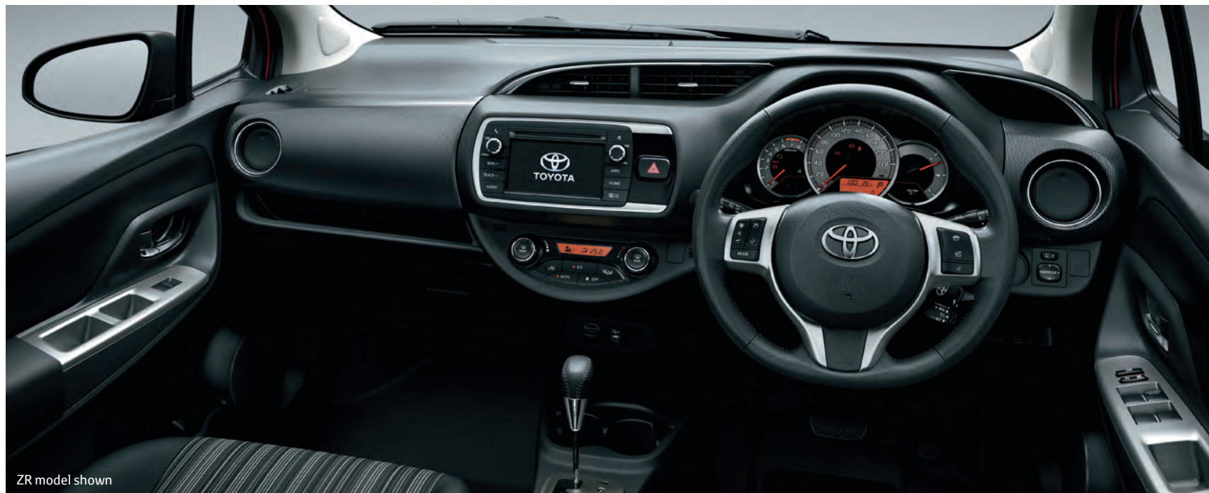
ZR model shown

You'll also find more storage space than you'd think possible in a car of this size, with Yaris Hatch offering a two-tier boot and convenient storage options such as dual level glove box.