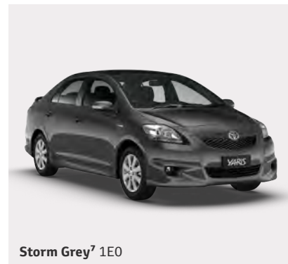
Storm Grey 7 1E0