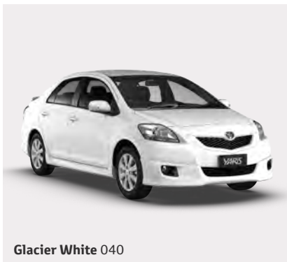
Glacier White 040

There is a great range of nine fun-loving colours available for Yaris Sedan. You'll find the right colour to match your personal style.