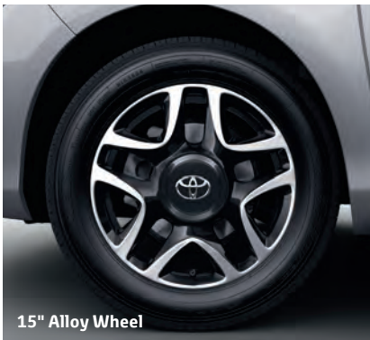
15" Alloy Wheel