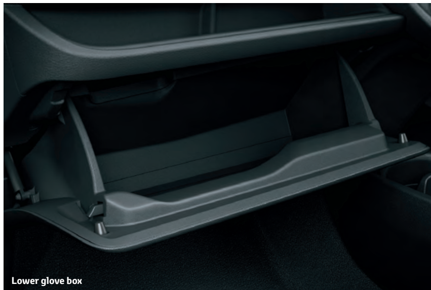
Lower glove box