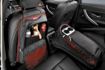
Backrest bag and storage bag with drinks holder