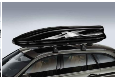
Roof box 460, decoration stripes