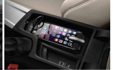
Universal Snap-in adapter