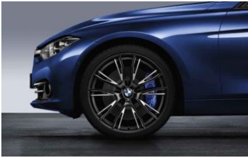
20" BMW M Performance, Double spoke 624 M, Bicolour light alloy wheels

For more information, please contact your preferred BMW Dealer who will be pleased to advise you on the full range of Genuine BMW Accessories, or visit bmw.com.au/accessories .