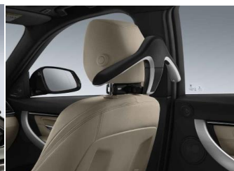
Travel & Comfort Clothes hanger