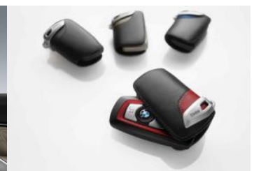
Key Holder – Sports line hanger