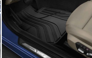
All weather floor mats