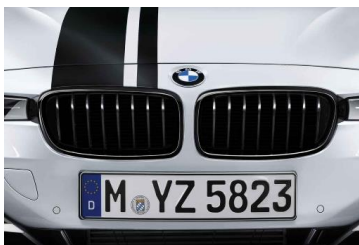
BMW M Performance kidney grilles, black high gloss